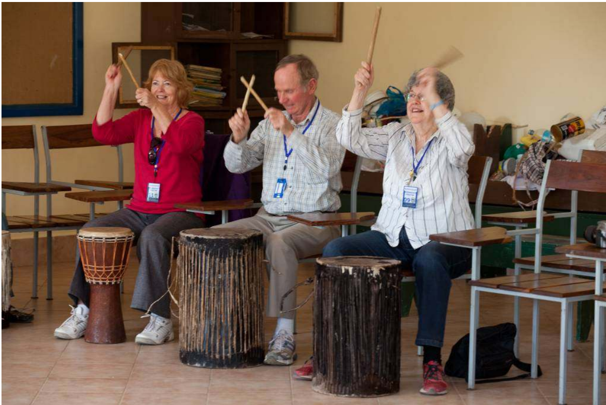
Members of our July Tour group were a hit during a Traditional African drumming workshop!