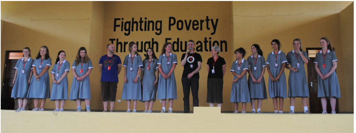
We continue to be blessed by the ongoing support of the staff and students at Methodist Ladies College (MLC), who brought new students to visit us again this year in September.