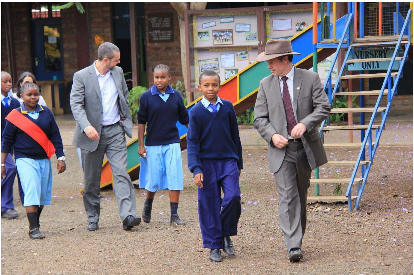
The Australian High Commissioner, Geoff Tooth, based in Nairobi dropped in to say "G'day".