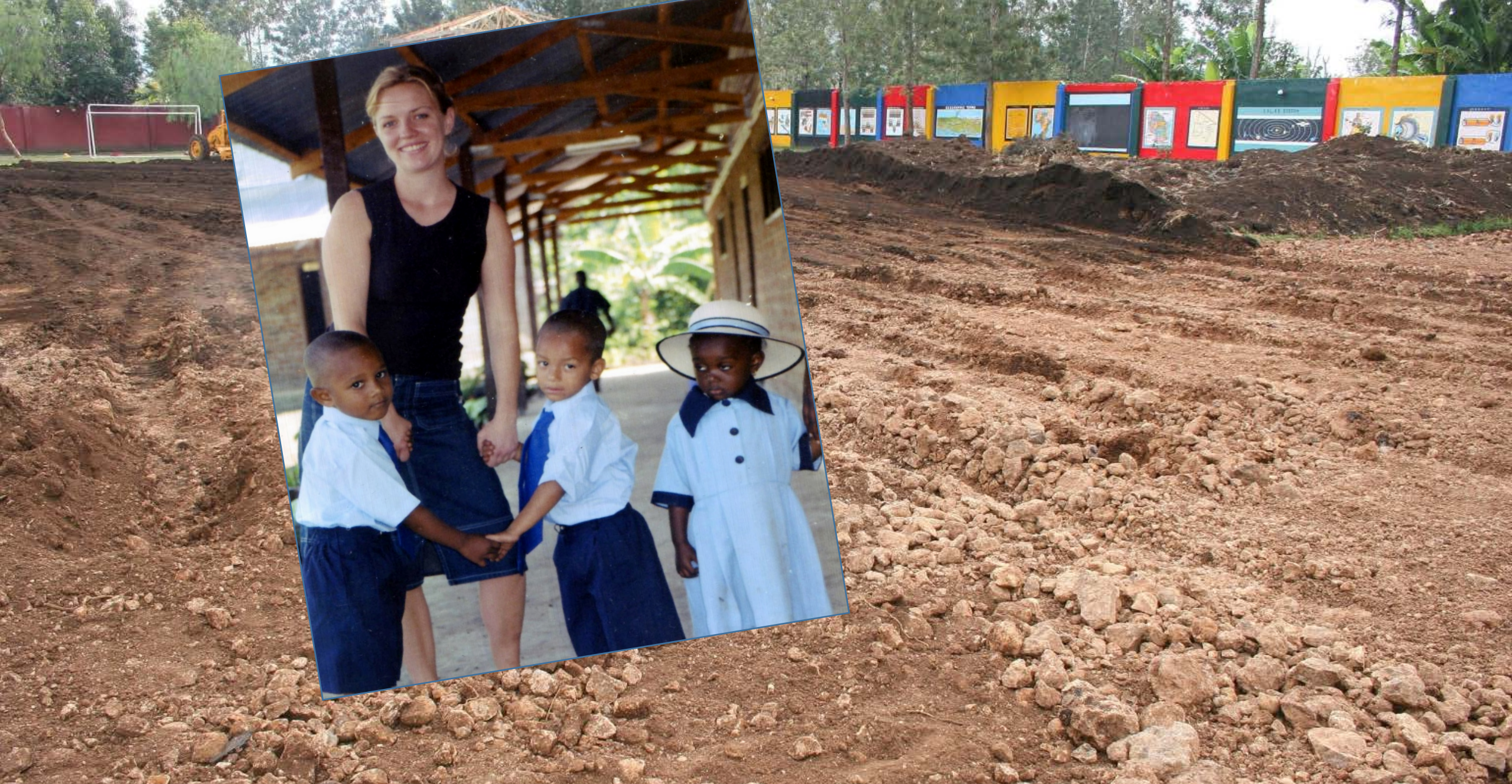
The school opened in 2002, with three students and one volunteer teacher.