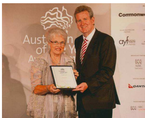
Mum recently accepted my nomination for me at the Australian of the Year Awards. I can't wait to see her!

The first gig is on the 2nd of March in Forbes then we troupe around various cities and regional areas for the entire month. From Orange to Devonport and so much in between. We'll be keeping the website events page up to date with all of the events and people can also follow me on twitter to see what I'm up to. I was so overwhelmed to receive such amazing support from people who put their hand up to host an event for St Jude's. Unfortunately due to time constraints we can't go everywhere so we will aim to get to these places next year.