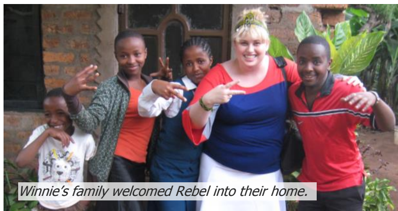
Winnie's family welcomed Rebel into their home.

See all the excitement from our 2016 Form 6 graduation ceremony on pages 4 & 5.