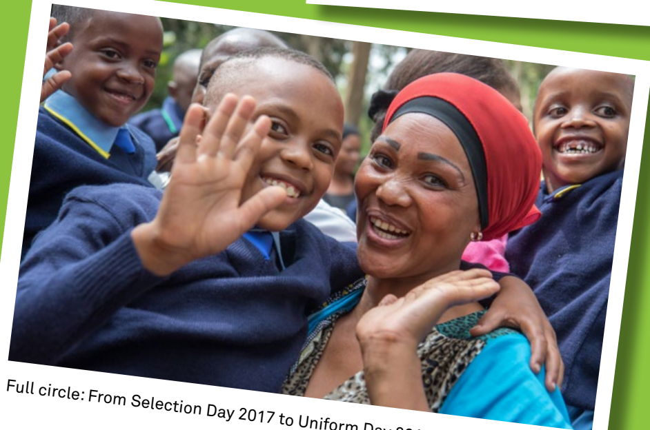
Full circle: From Selection Day 2017 to Uniform Day 2018.