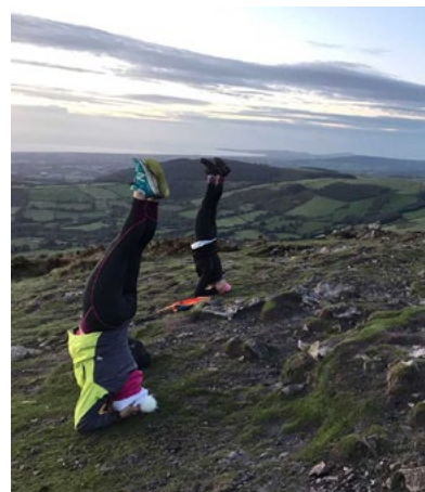
Sky-high fundraising: Yoga on a mountain is one of the most creative events we've heard about!

The engaging science teacher returned to her home in Woodstock, New York, eager to learn more about education in Tanzania. Fortunately, curiosity led her to St Jude's website.