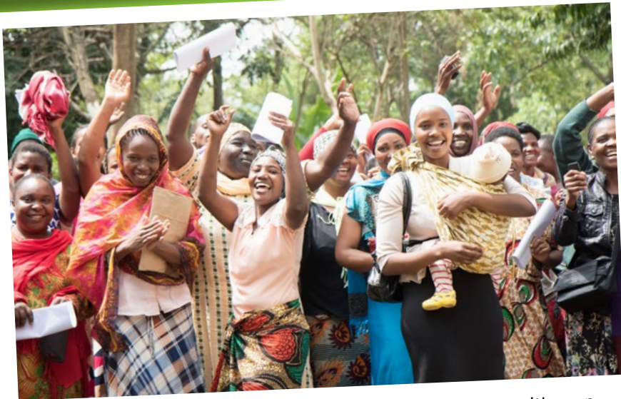
Time to celebrate!: Parents welcomed their uniformed children with open arms.