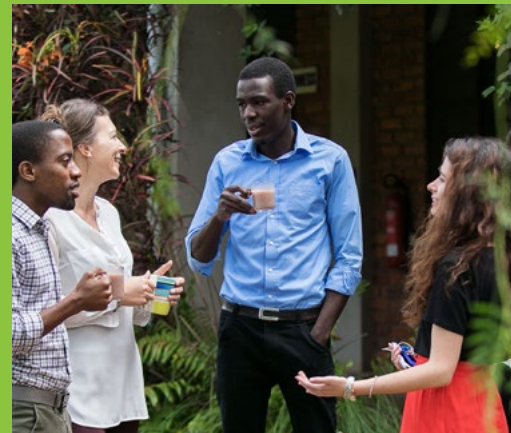
Making friends, making a difference: Staff enjoy sharing morning tea and lunch, provided by the School.