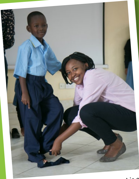
Many hands make light work: The event is a yearly highlight for our hardworking staff.