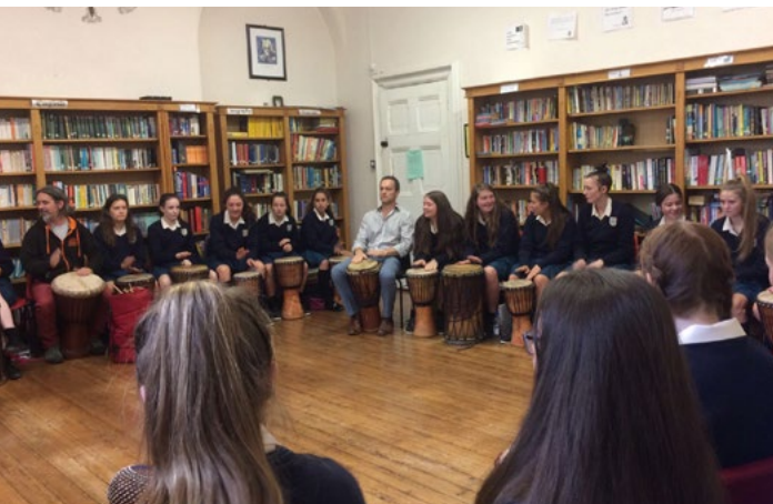
To the beat of a drum: Students from Dominican College Wicklow are looking forward to their Tanzanian adventure.

Additionally, the group is spreading the word through their Instagram page. Follow their fundraising journey at @tanzaniagroup2018, or via their blog: http://www.dominicanwicklowatstjudes.com/