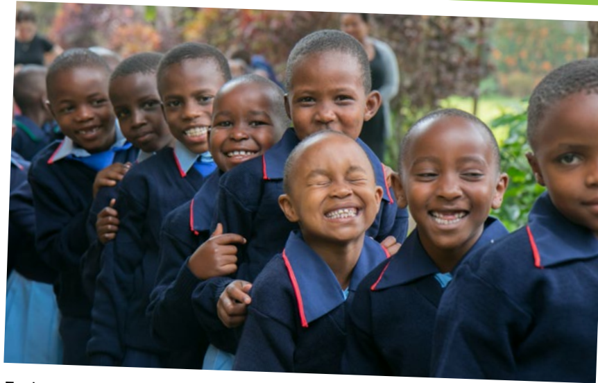
Excited and expectant: They couldn't wait to greet family at St Jude's gates!