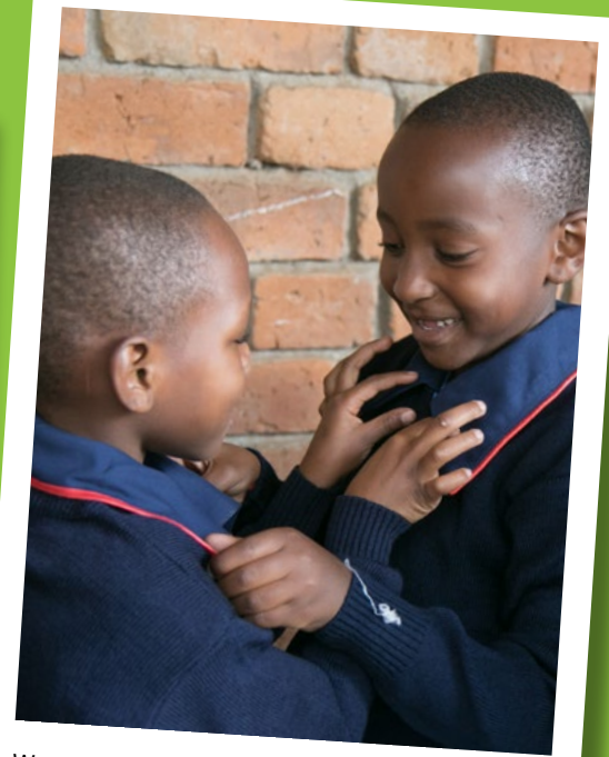
Worn with pride: New students helped each other adjust collars and straighten ties.