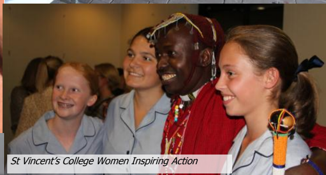
St Vincent's College Women Inspiring Action