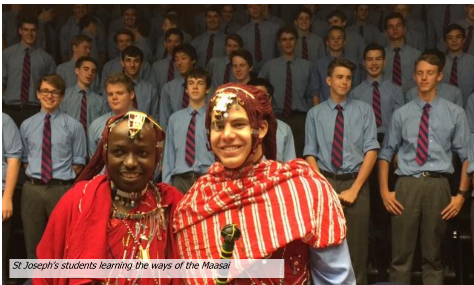
St Joseph's students learning the ways of the Maasai