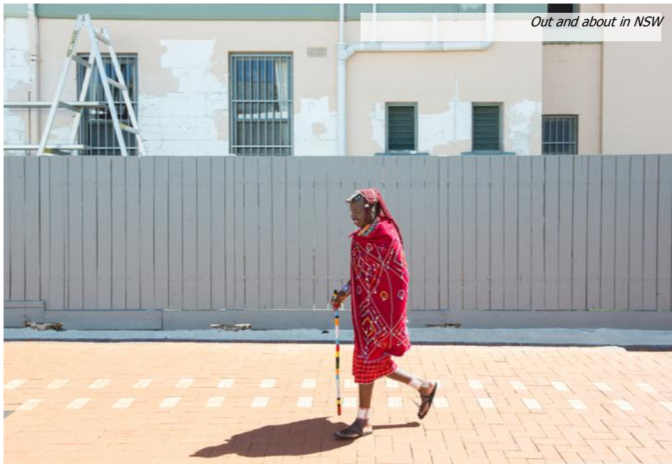
Out and about in NSW