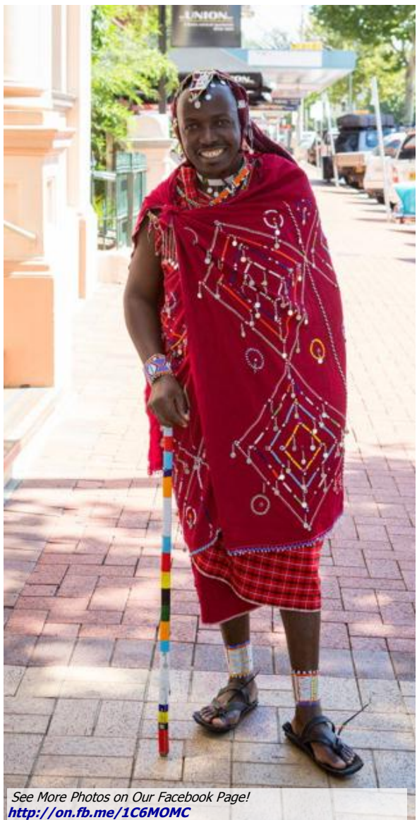
See More Photos on Our Facebook Page! http://on.fb.me/1C6MOMC