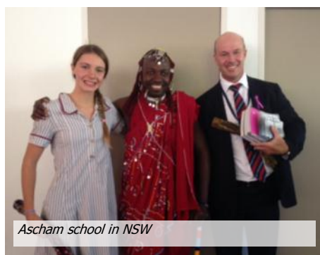
Ascham school in NSW