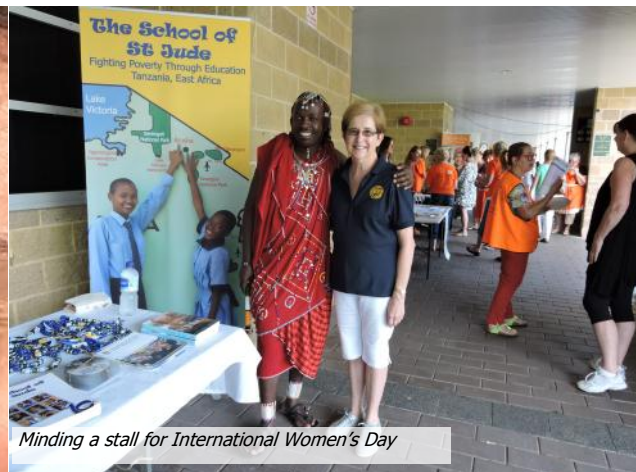
Minding a stall for International Women's Day