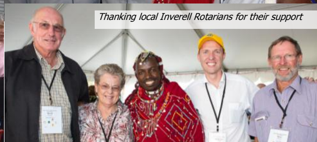
Thanking local Inverell Rotarians for their support