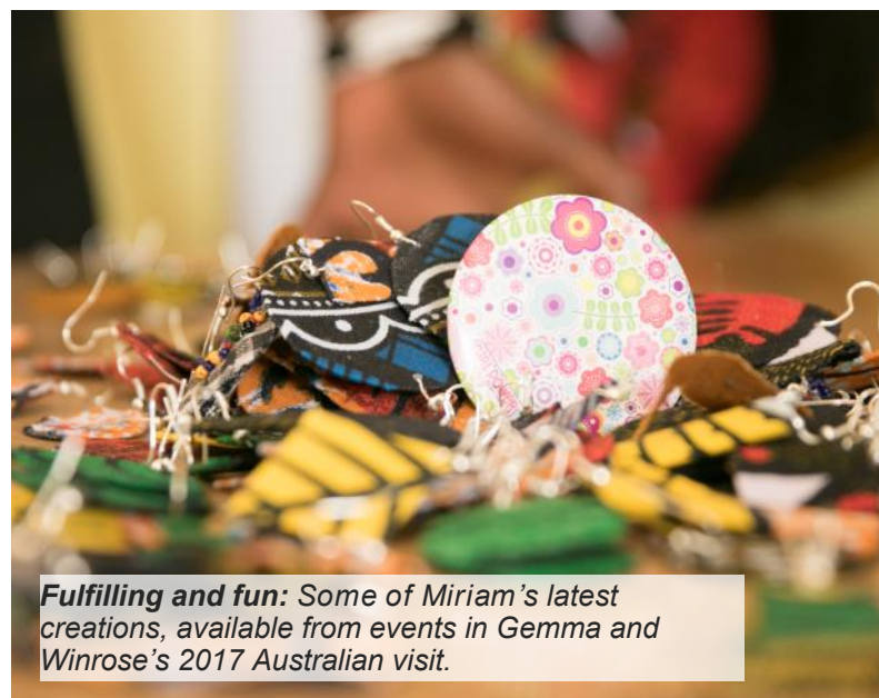
Fulfilling and fun: Some of Miriam's latest creations, available from events in Gemma and Winrose's 2017 Australian visit.