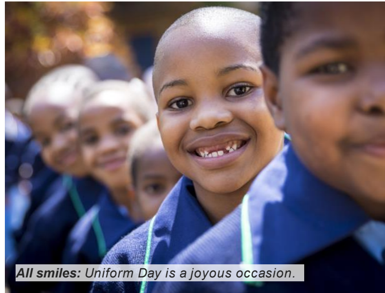
All smiles: Uniform Day is a joyous occasion.

In 2017, we are proud to be educating more than 1,800 in-need Tanzanian students throughout the