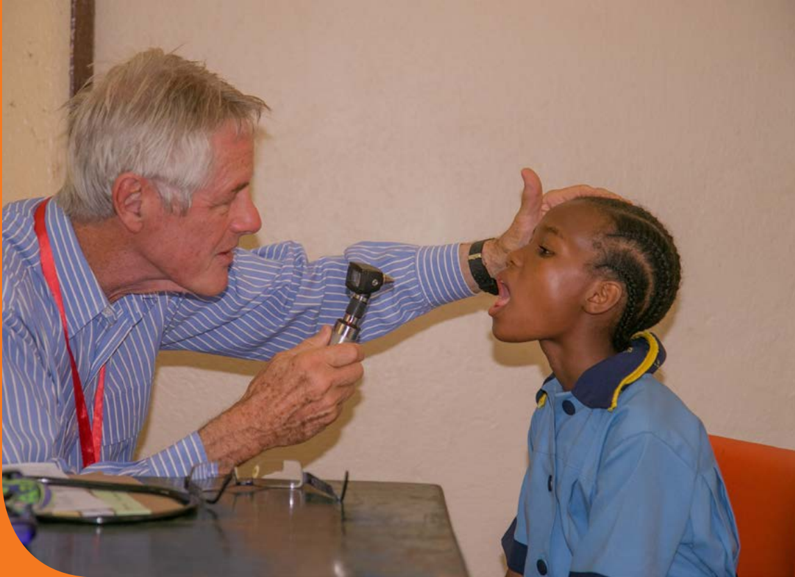
Left Checking in: The doctors were responsible for checking every student, from head to toe.