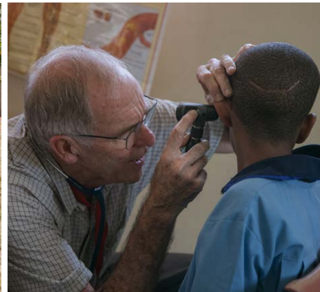
Top Right All ears: Students need to be able to hear teachers and classmates.