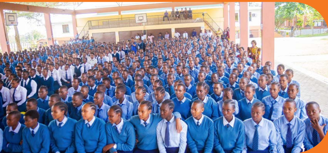
Top Raising the roof: Students packed out the assembly hall during the special ceremony. Bottom Time for change: Students sat together in solidarity to fight gender inequality.

As the first empowering song played out to the assembly hall, students and staff raised the roof, their solidarity was a force to be reckoned with.