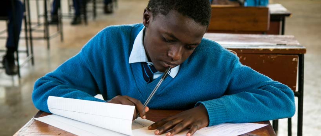
Top Midterm mindset: Exams are each timed to up to three hours.