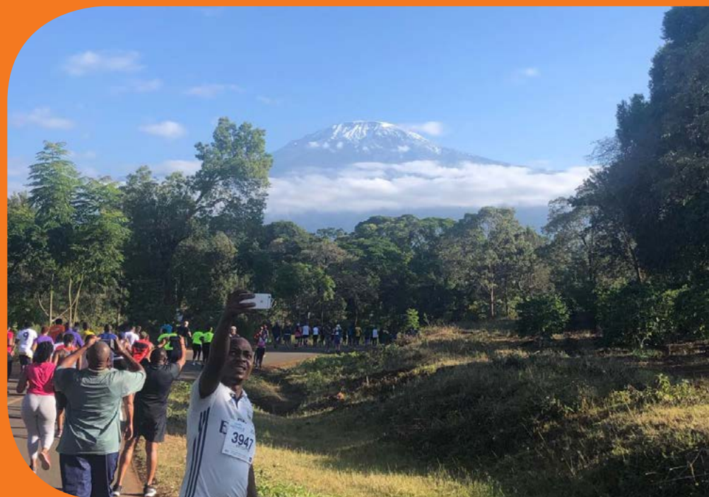
Bottom Scenic run: Mount Kilimanjaro made for the perfect backdrop for the event.