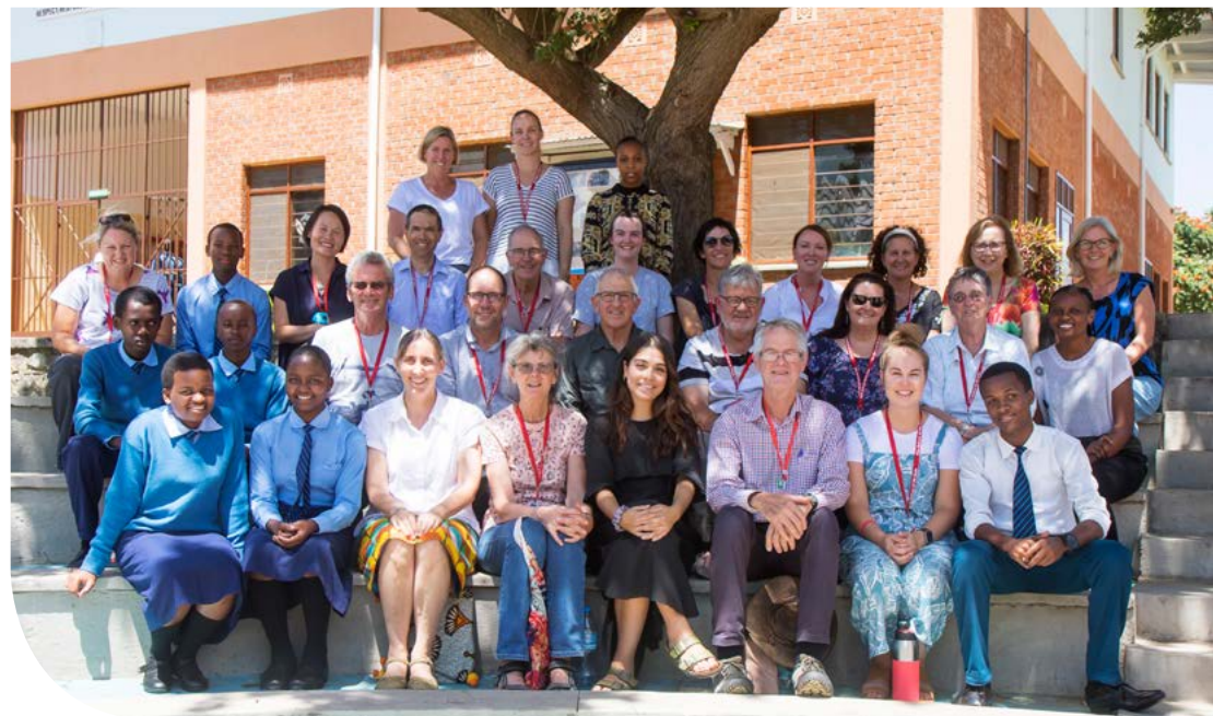
Bottom International effort: A special thanks to our biggest Health Check team yet.