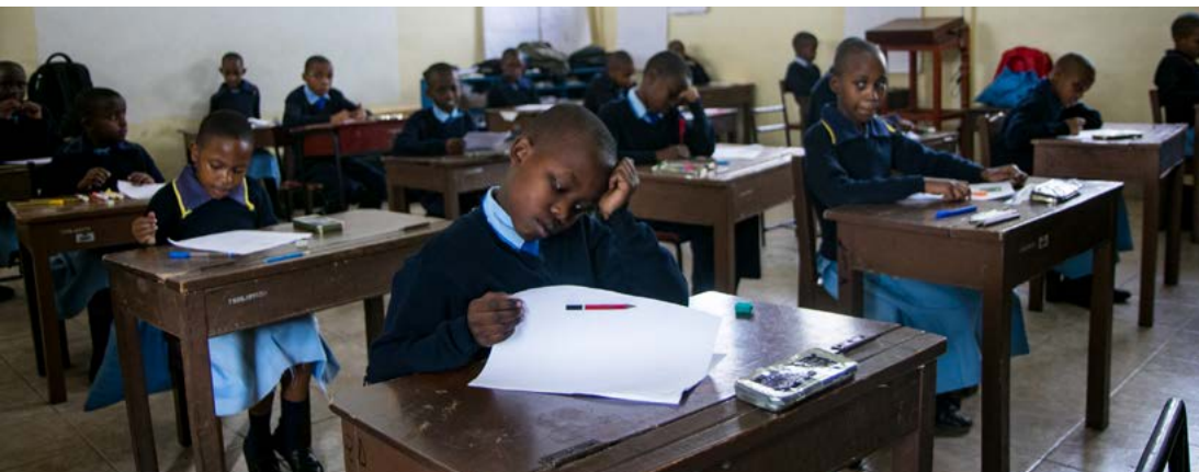
Bottom Putting yourself to the test: Each result will be sent to parents and sponsors.