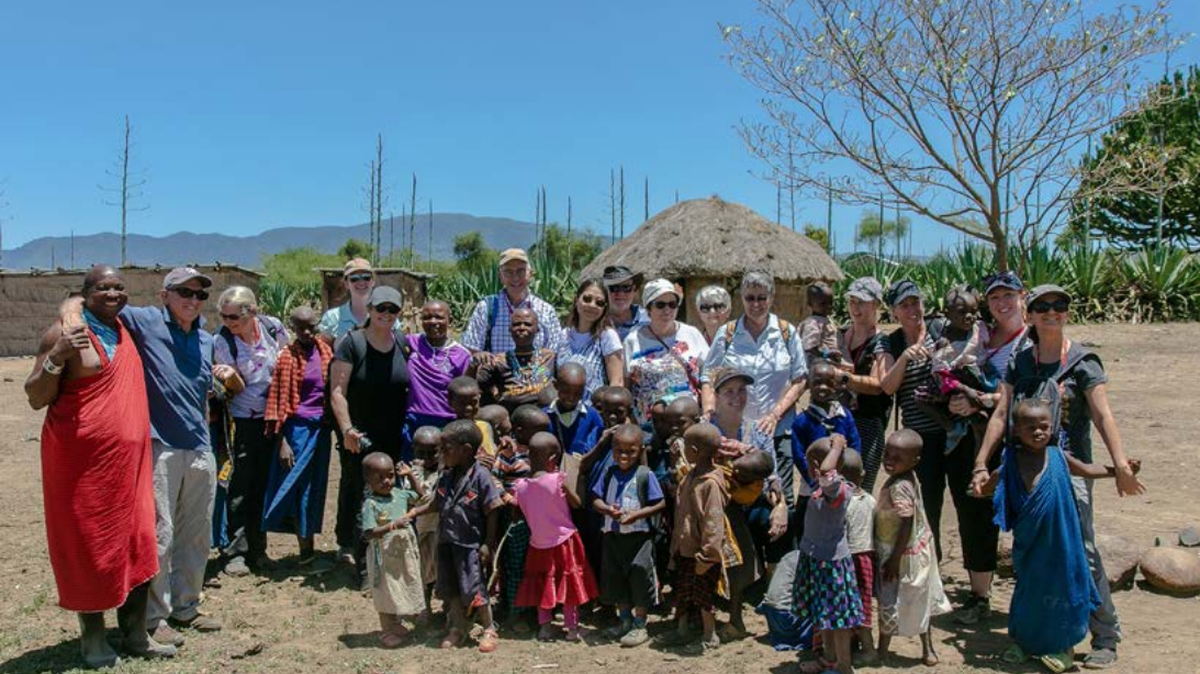
Top Cultures combine: Visitors with Maasai tribe members at Langidare village.