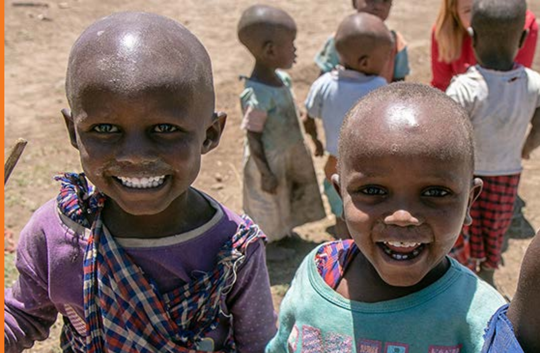
Top Warm welcome: Visitors were greeted by Maasai children.

Gifting a goat goes a long way in the Maasai tribe, they're not only a source of nutrition but goat breeding can be a pathway out of poverty, meaning the family group couldn't believe their luck when they saw Judy was pregnant.