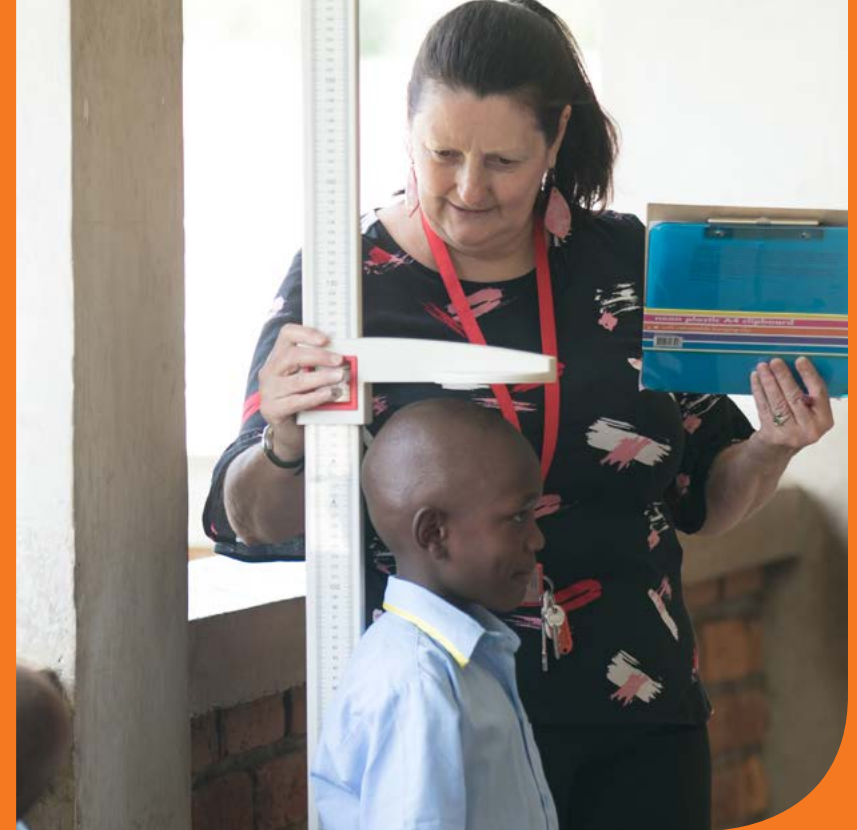
Right Sizing up: The team recorded all heights, weights and BMI's of the students