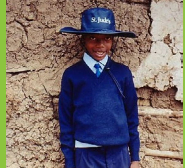
Bringing the journey full-circle: Uniform Day, 2003.