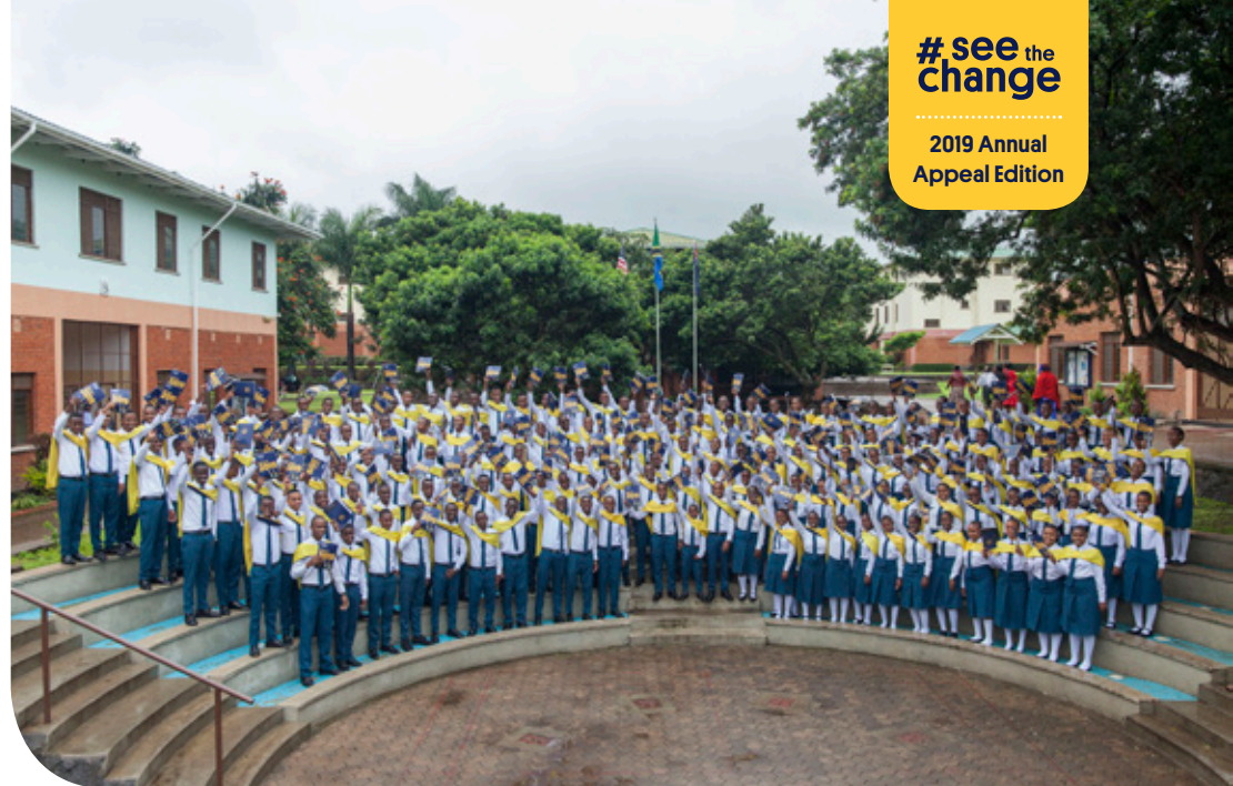
Top Largest Cohort: 2019 sees our largest group of graduates, 169 students.

Congratulations to the Class of 2019, we are all so proud of you.