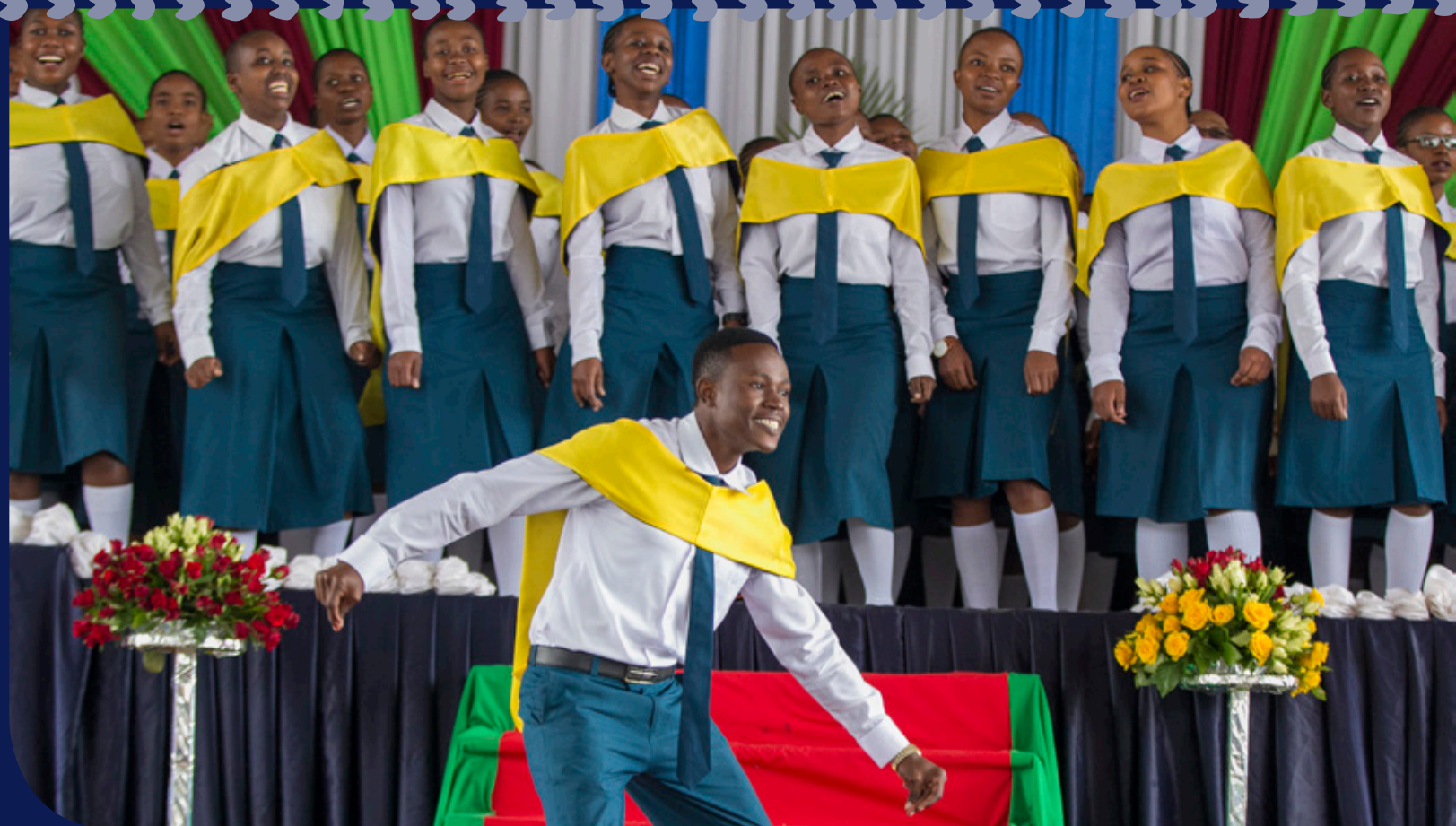
Top Lifting the Roof: Graduating class perform their farewell song for guests.

Thank you for sharing our newsletter with your family and friends.