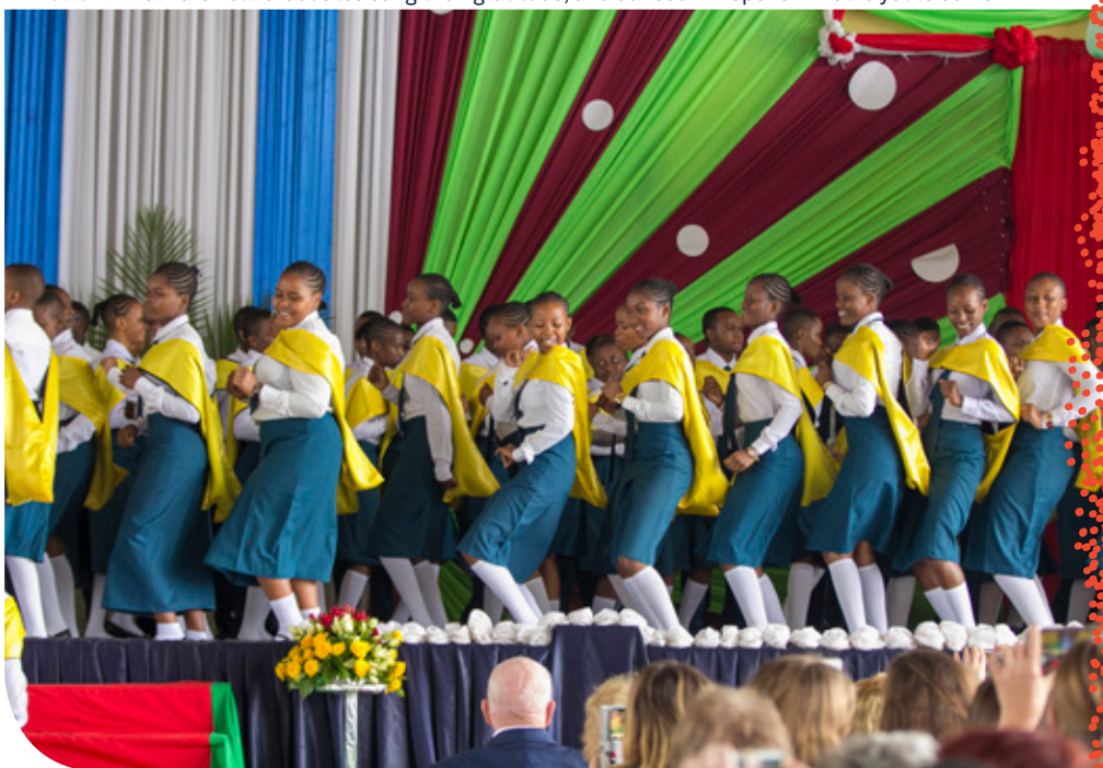
Bottom Final Farewell: Graduates sang their gratitude, and danced in hope for what is yet to come.