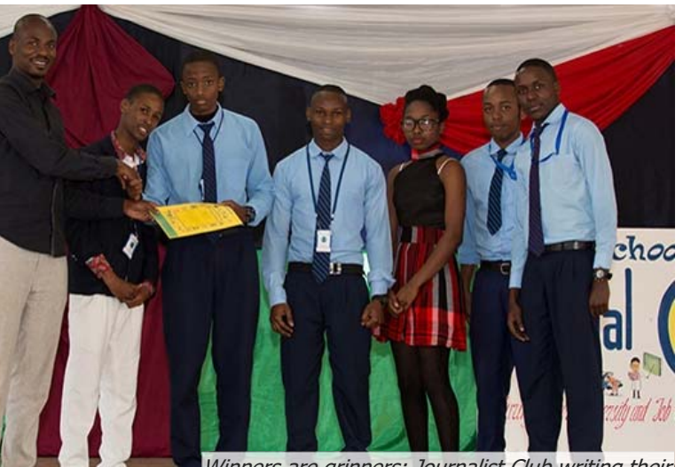
Winners are grinners: Journalist Club writing their way into St Jude's history.