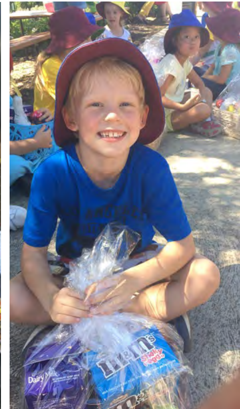
Happy heroes: Our Lady Help of Christians staff and students have enjoyed supporting St Jude's.