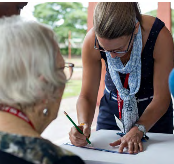
Signing up for seconds: The mother-daughter duo are excited to co-share a new sponsorship!