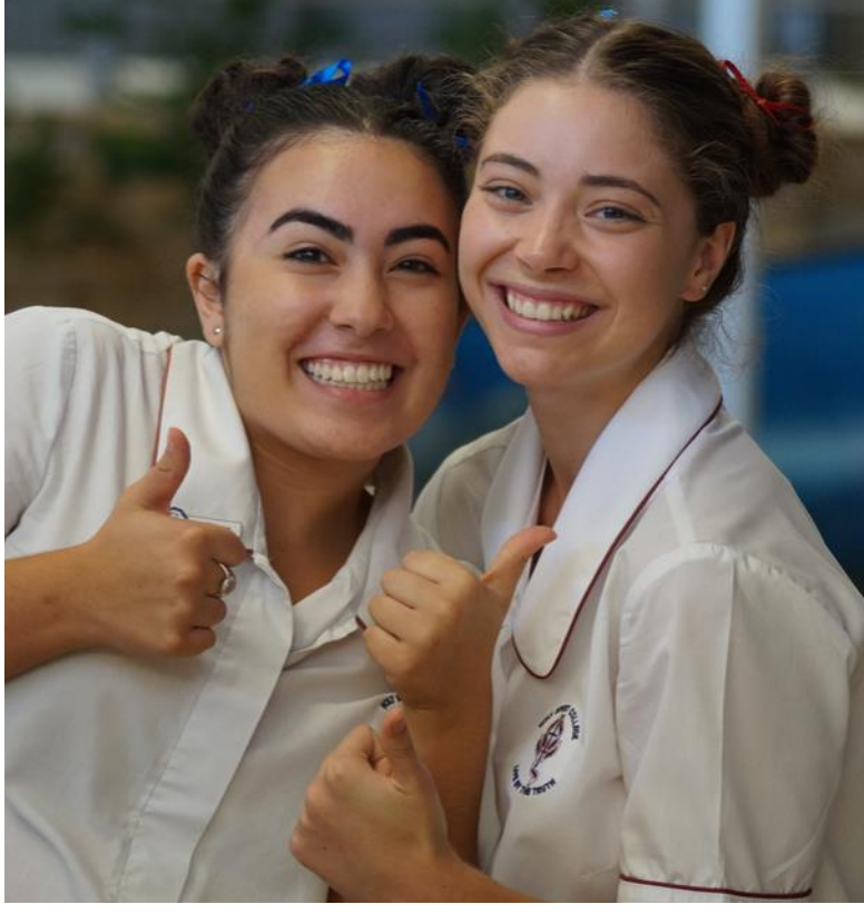
Above: Students of Holy Spirit College get into the spirit with their Two Bun Tuesday for Tanzania event. Left: Students and staff join in the fun.