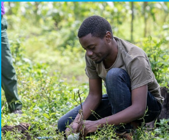
Mission Green, super keen: Members of St Jude's Rotary community have planted dozens of trees so far!