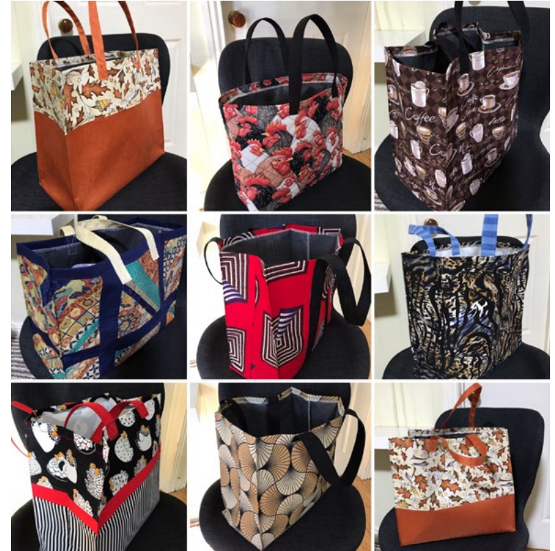
Joy for Jill: Coupling creativity with compassion is a great combination!