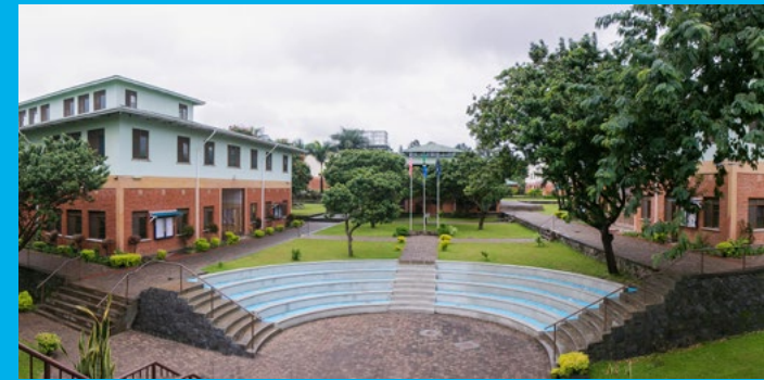
Once a maize field: The lush grounds of Smith Secondary Campus in 2018.