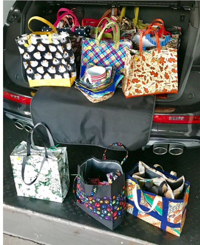
Best-selling beauties: Jill's shopping bags have been a hit with family and friends!

"It really is easy to promote the wonderful work of St Jude's, the staff and students. If I can sit at my sewing machine doing what I love for such a good cause, knowing every cent is being spent wisely, others should try it too!" Jill explained.