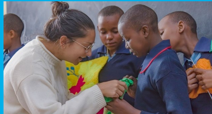
Inspiring future Rotarians: St Jude's primary students are enjoying the EarlyAction!