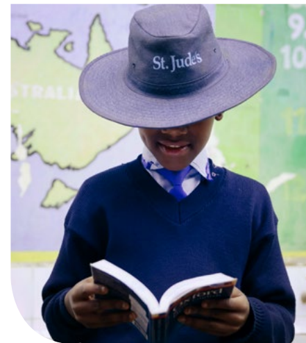
Imagine this: Books open minds and hearts.