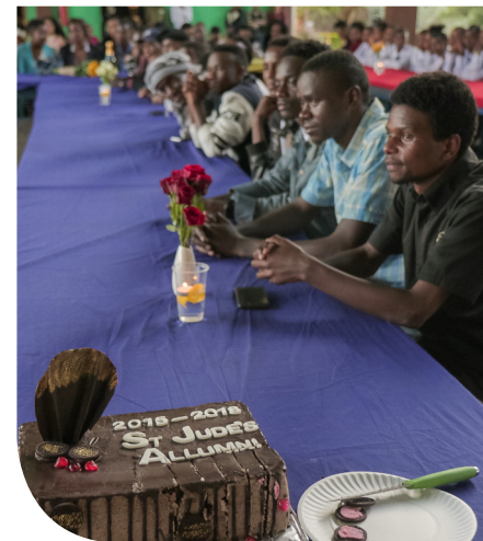
Sweet Reunion: Alumni were treated to a delicious evening!