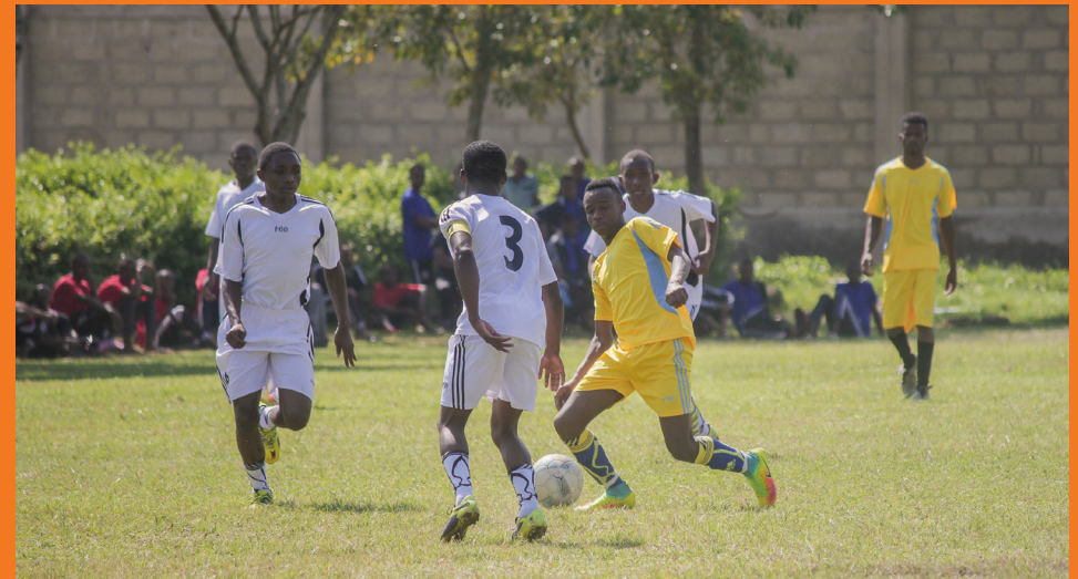
Back in the game: The reunion ended with a sports bonanza between graduates and students.