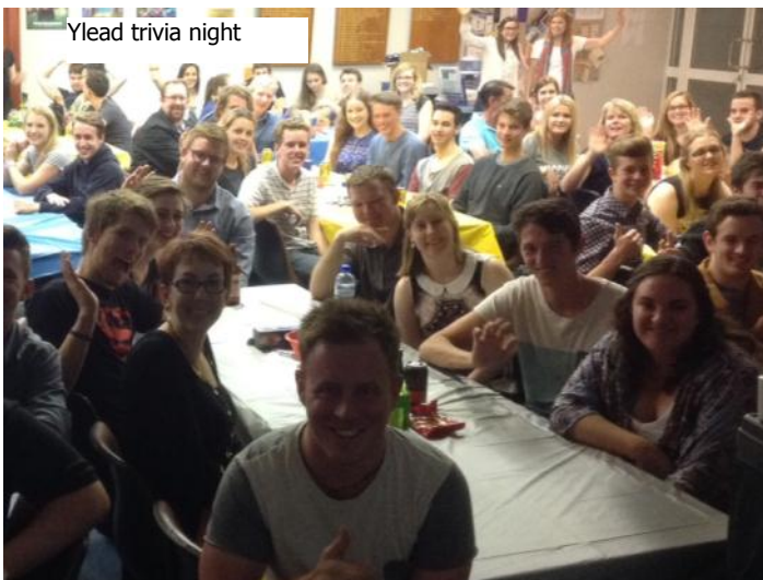
Ylead trivia night