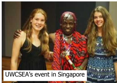
UWCSEA's event in Singapore