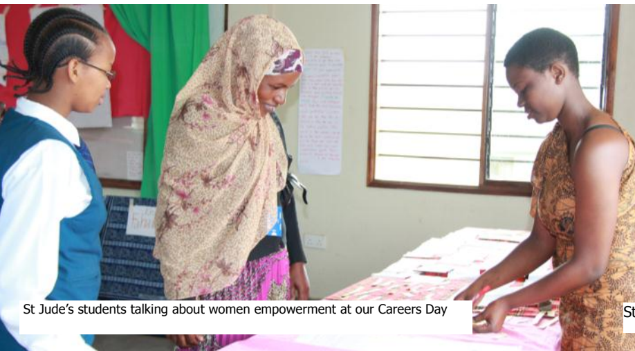
St Jude's students talking about women empowerment at our Careers Day