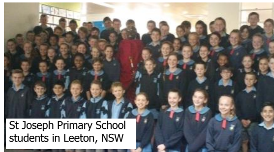
St Joseph Primary School students in Leeton, NSW