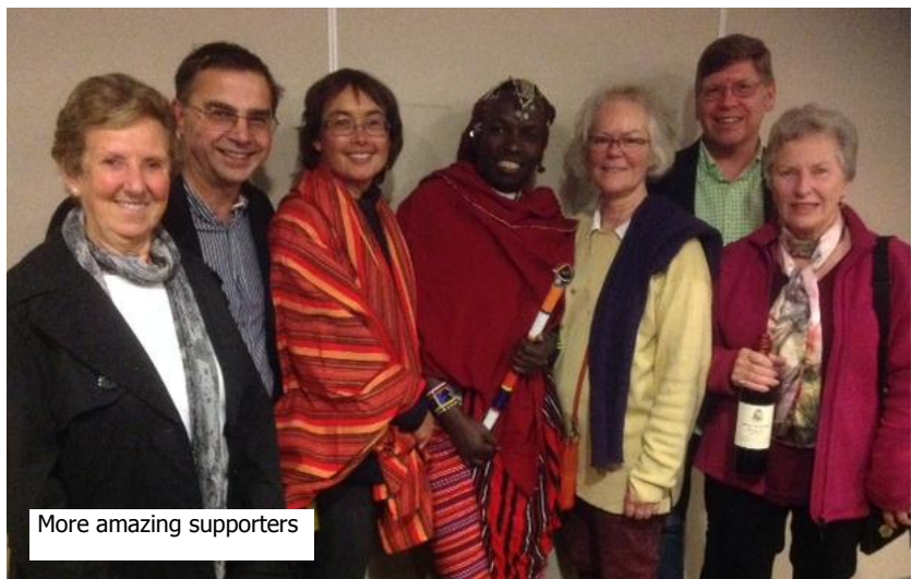
More amazing supporters

See more photos on our Facebook page! http://on.fb.me/1zhMfRf