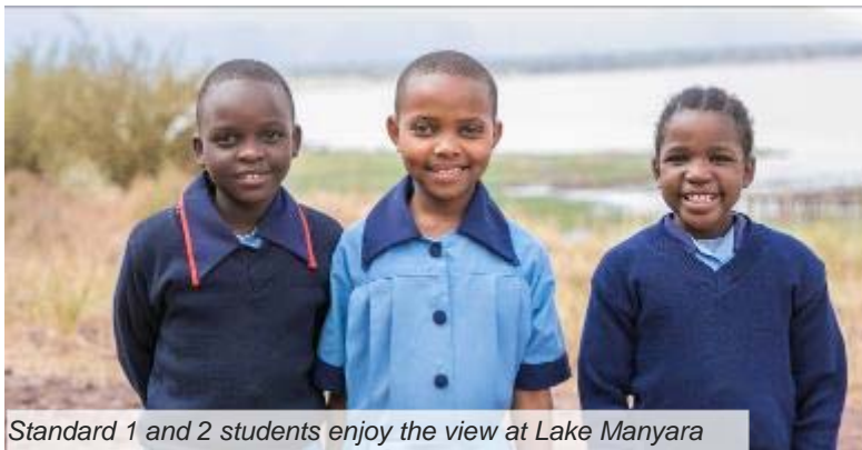
Standard 1 and 2 students enjoy the view at Lake Manyara

Want to join our students? Go to... www.flickr.com/photos/133385067@N06/sets/72157672451497302/ Or why not visit us and see it all for yourself! www.schoolofstjude.org/visit-us/making-a-visit.html Email visitors@schoolofstjude.co.tz or call +255758305776