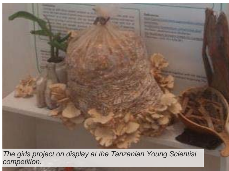
The girls project on display at the Tanzanian Young Scientist competition.