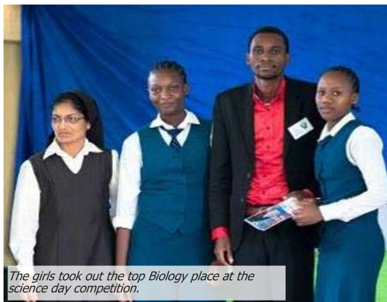
The girls took out the top Biology place at the science day competition.