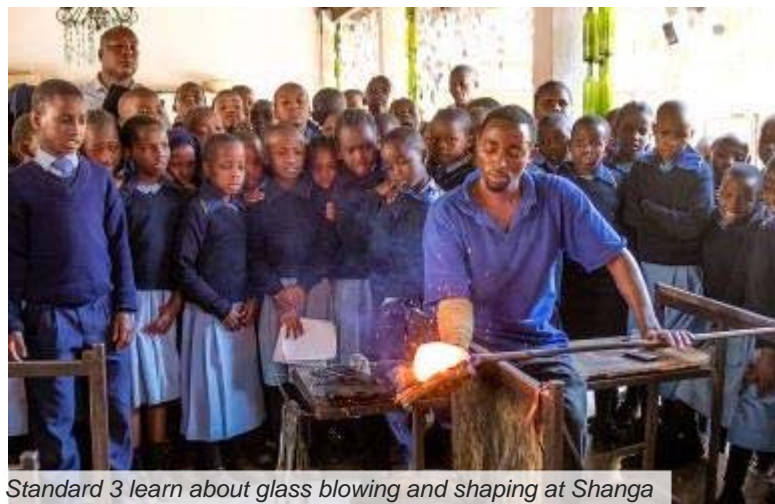
Standard 3 learn about glass blowing and shaping at Shanga

Standard 1 and 2 students visited Lake Manyara National Park, one of the most picturesque stops on Tanzania's famous safari circuit. Their geography lessons came to life watching hippos, elephants and buffalos cooling off in the water. After seeing these animals with their own eyes, the students better understand the importance of national parks in Tanzania.