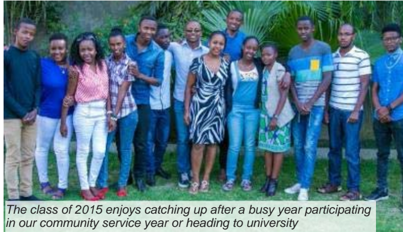
The class of 2015 enjoys catching up after a busy year participating in our community service year or heading to university