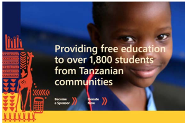
Our new landing page!

Check out the rebrand concept video at: www.schoolofstjude.org/st-judes-in-action/st-judes-has-a-new-look .