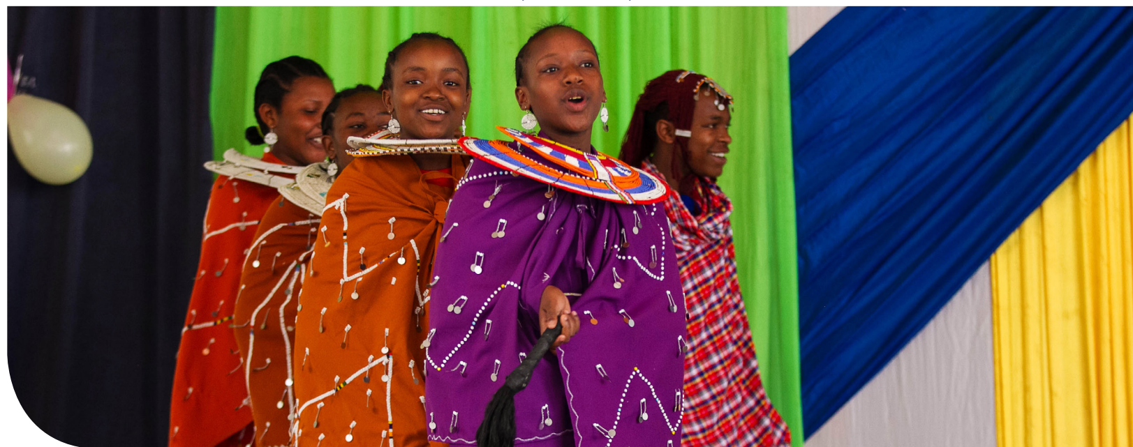
Bottom Cultural pride: Students performed traditional dance in celebration of their classmates.