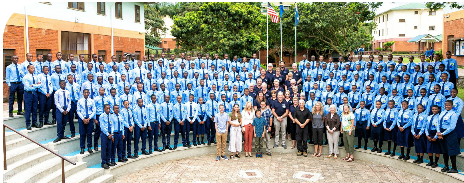
Top International family: The event was attended by many supporters from Australia and New Zealand.