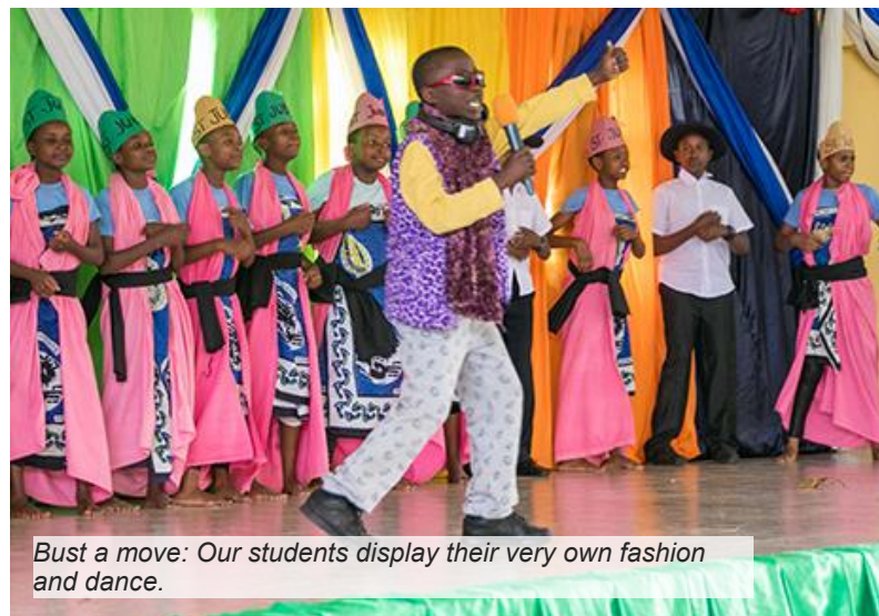
Bust a move: Our students display their very own fashion and dance.