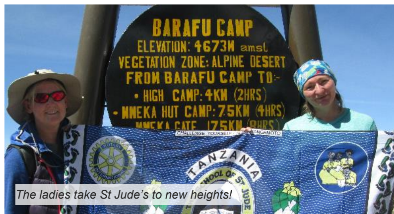
The ladies take St Jude's to new heights!

Upon returning home to the United Kingdom, the ladies have kept up their efforts. They continue to help spread the St Jude's message and fundraise to sponsor two of our students that they met on their trip.