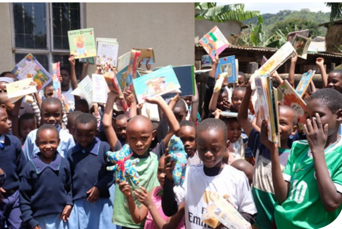
Below Success!: A group of orphans showing off their gifts from St Jude's.

“St Jude’s has helped me by educating my child,” she says. “This means I am able to use the money I’ve saved to help my other children go to school.”