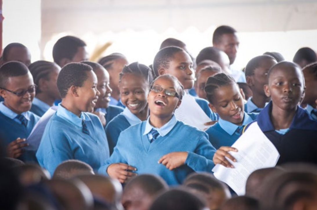
Above Enjoying The Festivities: Students enjoyed dancing to the performances.