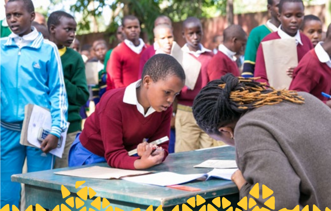
Left Document Checks: Hopeful candidate submits her documents prior to sitting the exam.