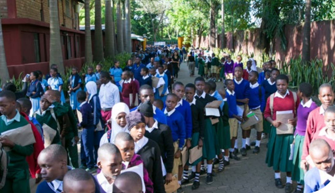
Above Waiting Lines: Hundreds of students lining up to be checked off the register.

The waiting teenagers are standing side-by-side, 20 wide, and snaking all the way back down the dirt road outside St Jude's.