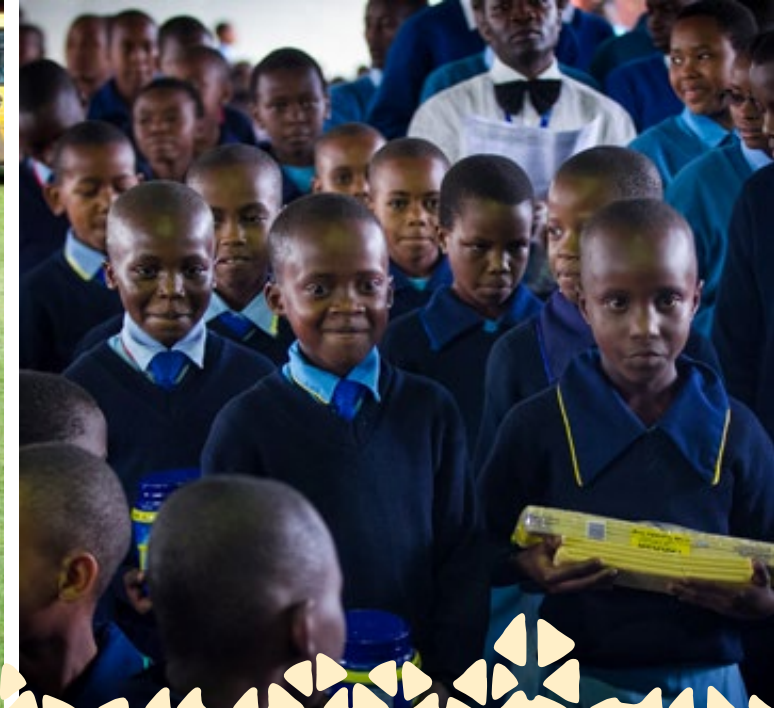
Right Gift Giving: Primary students offer their gifts to orphans in the surrounding region.