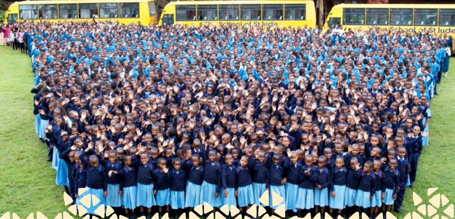
Left Gathering As One: Primary and secondary students gather for whole school photo, alongside staff.