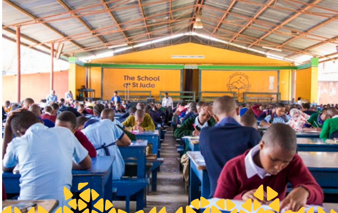
Right Packed To The Rafters: The assembly hall at full capacity, as students get to work.