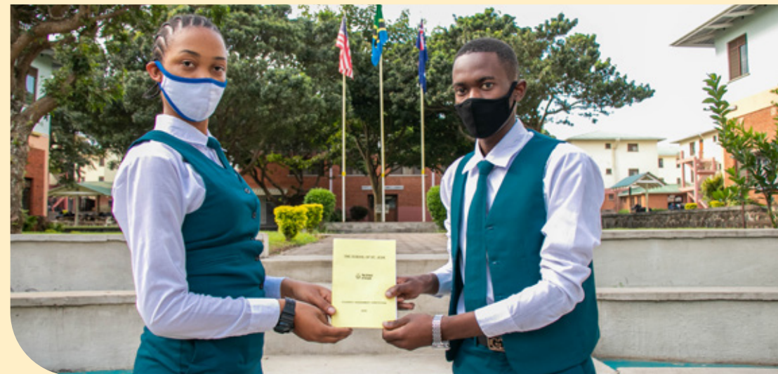
Below Taking an Oath: The newly elected Head Boy and Head Girl take their oath.

You can sponsor a secondary students’ academic scholarship and help to support students develop leadership skills to become future leaders of Tanzania.