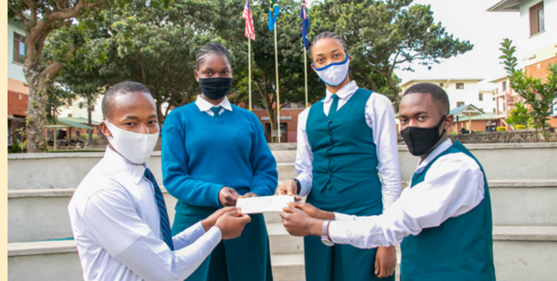
Above Happy to Have Served: Former Head Boy and Head Girl handing over the pledge book to the newly elected student government leaders.

Students at Smith Campus take leadership very seriously and deem being part of the school government as an important role and skill to have.