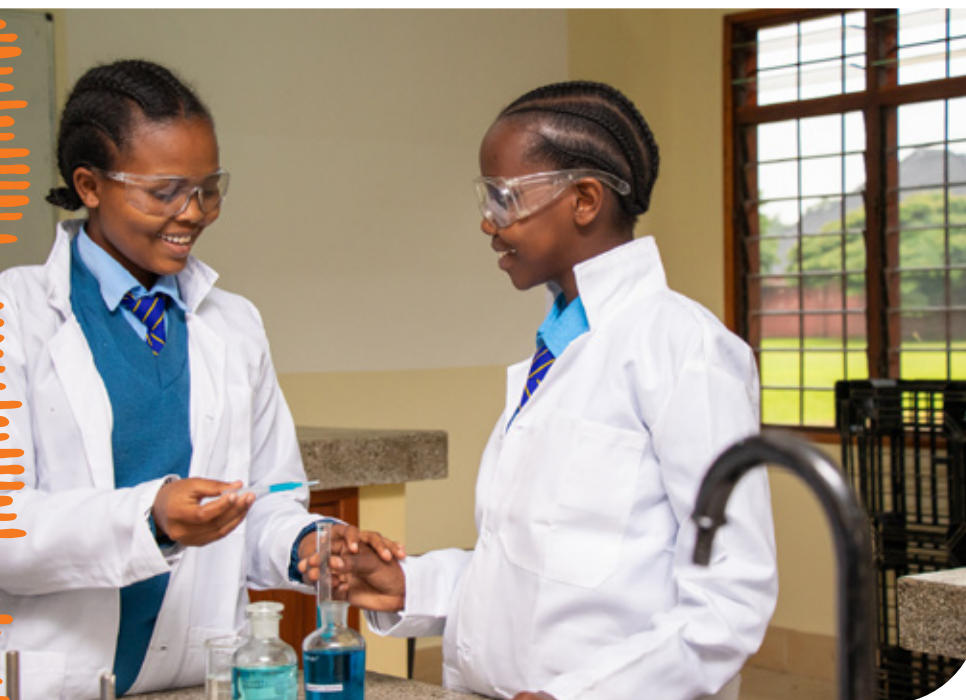
Below Smiling Scientists: Female science students working together in the lab.