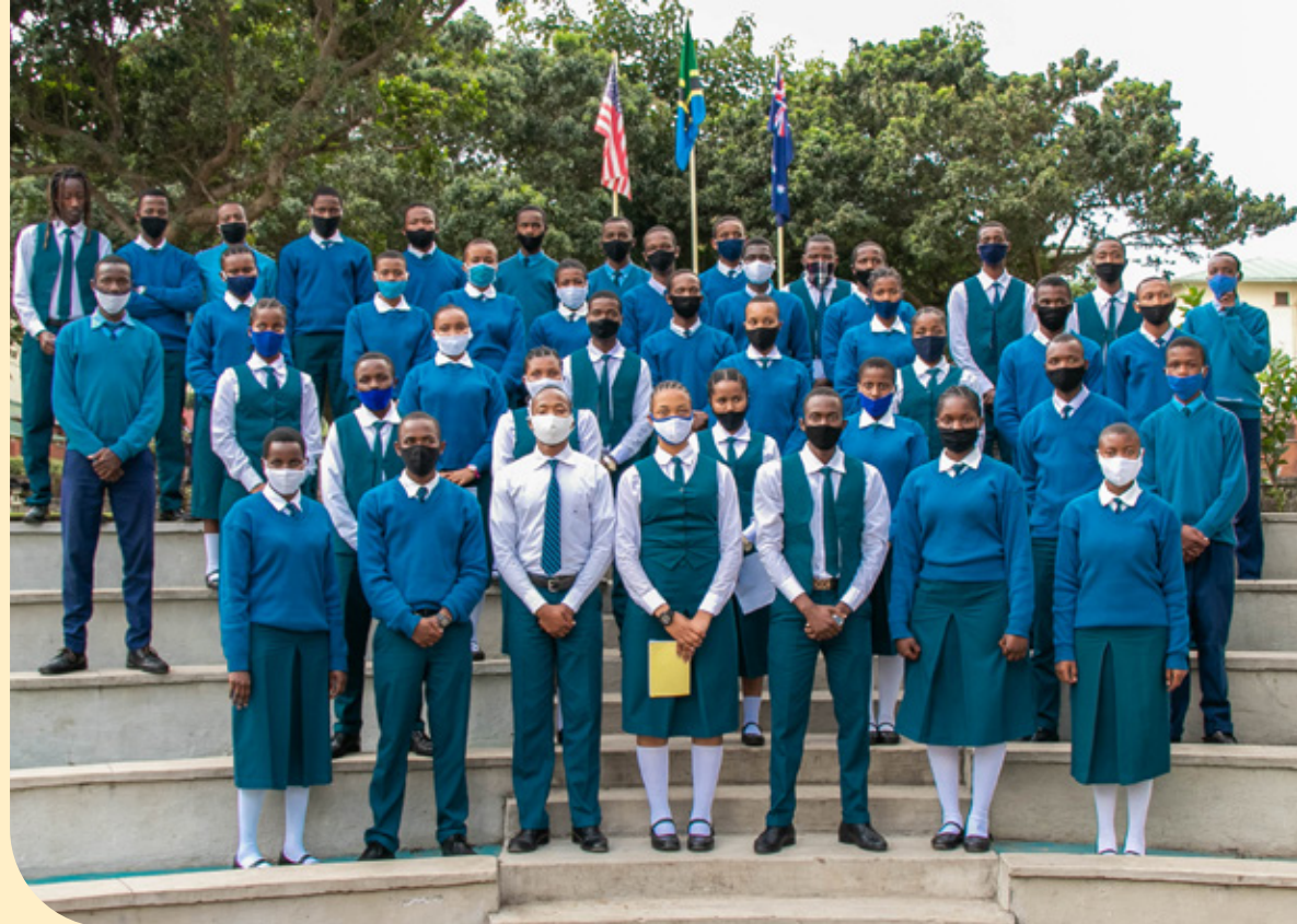
Above Future Leaders: The newly elected student government body, standing tall and proud.