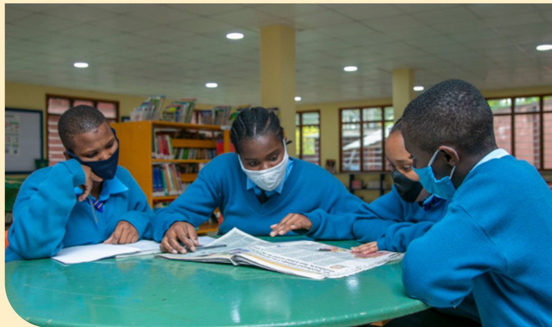
Below Journalism Club: Students from the Journalism Club working on ideas for their school newsletter.