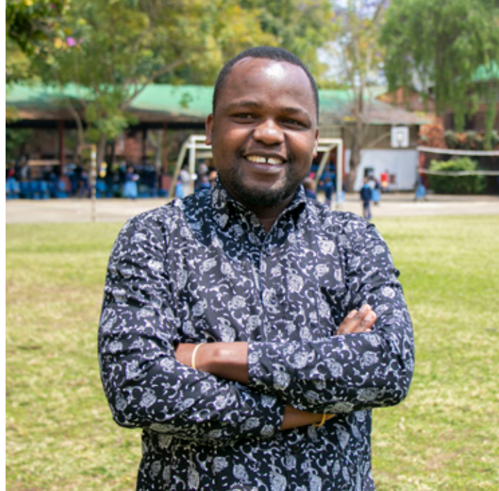
Middle Smile of Certainty: Mr Deo, sharing tactics that will assist students in achieving excellent results in the upcoming exams.