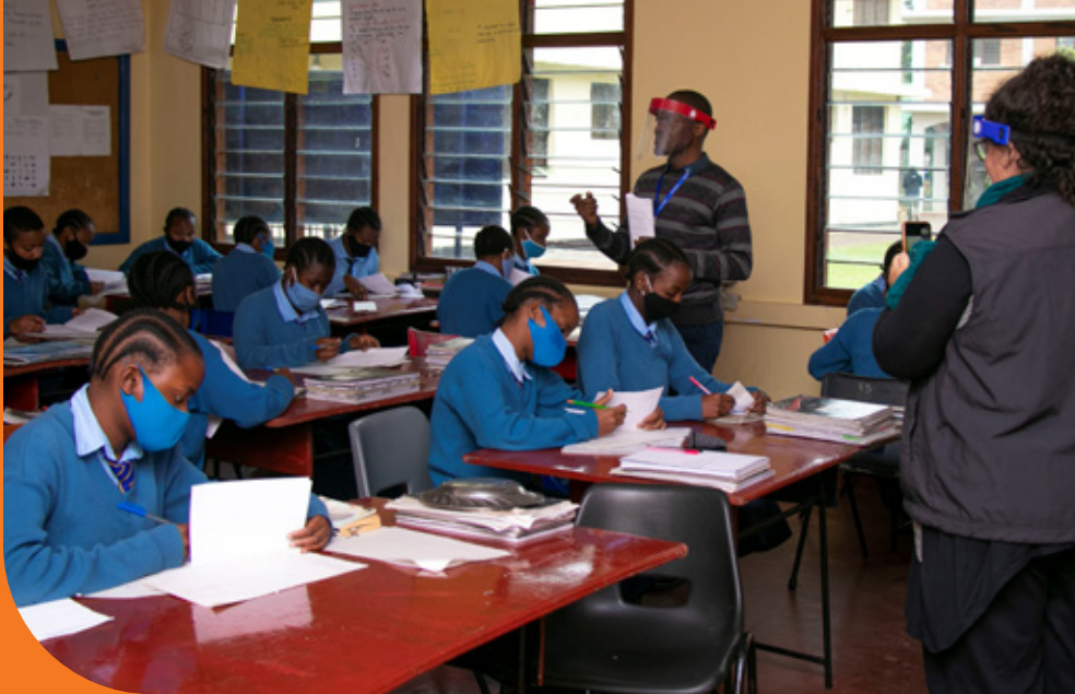
Left Class in Session: A live experience of a secondary school class.