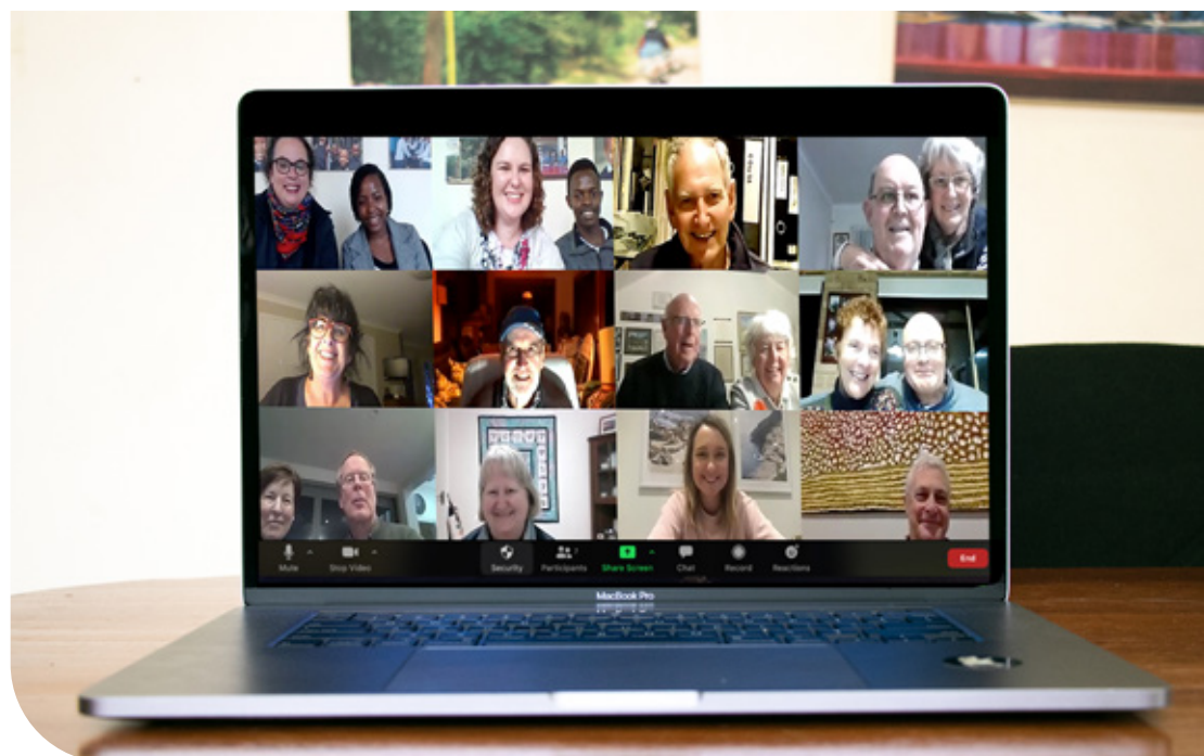
Below Boom in Zoom: The international family of supporters connecting with St Jude's through Zoom.