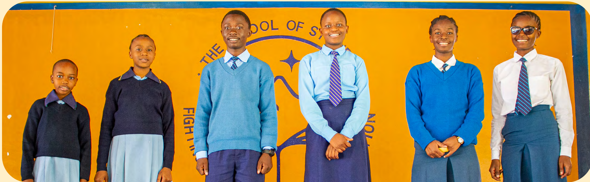
Above Speaking From The Heart: The winners of St Jude's recent public speaking competition.

“If a person can speak publicly, without any fear, then she can change the situation that we face as a country.”