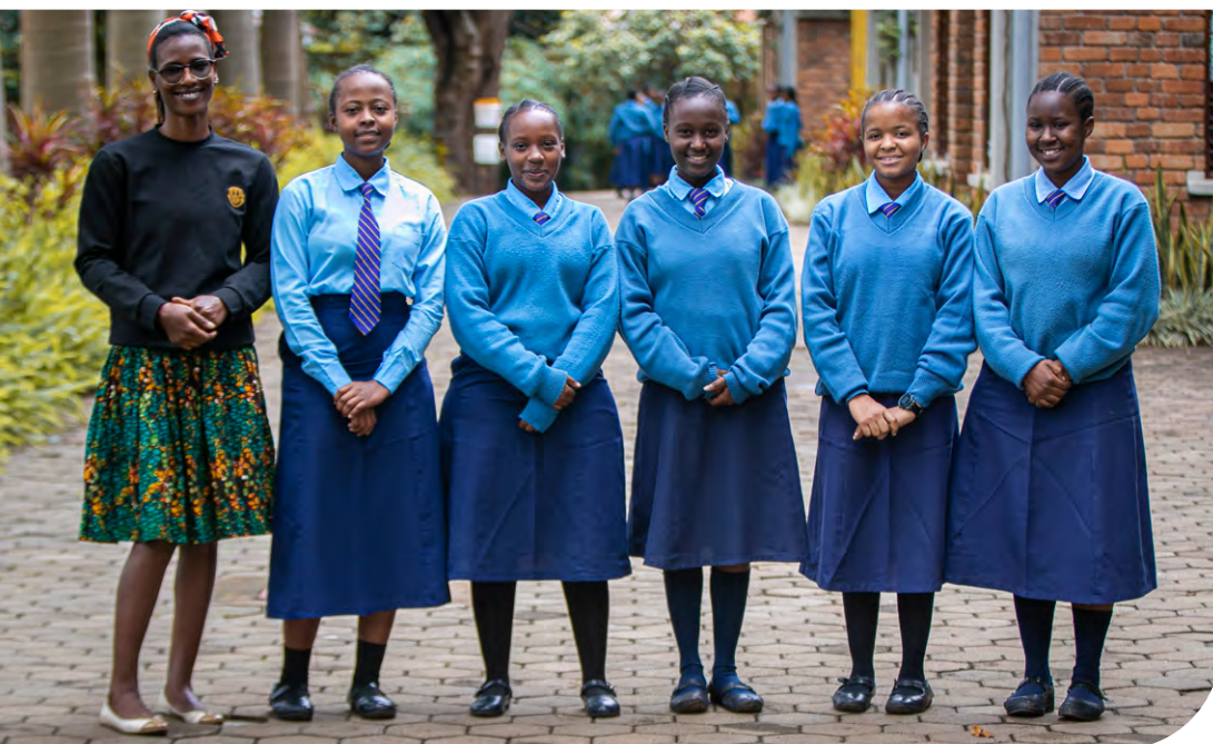
Below A True Team: The students worked together to create a speech to be proud of.

In the end, the students created a speech which examined the impacts of bullying and made suggestions about how to reduce it in schools. The issue is particularly close to the students' hearts.