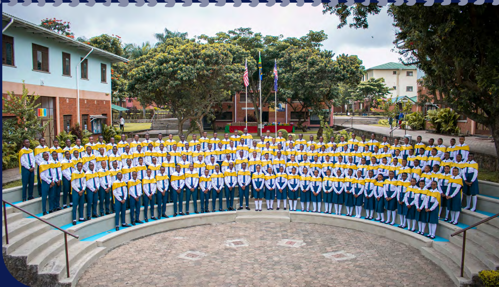
Top The Class of 2021: Congratulations to the seventh graduating class of Form 6.