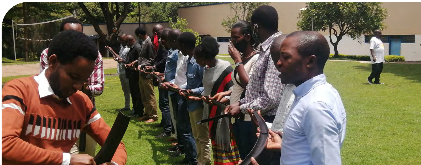
Below Team Building Exercise: St Jude's academic leaders emerged stronger and more unified after the training day.

Your support is helping the academic team reach new heights of effectiveness and transformation so they can provide a nation-leading and values-driven education to St Jude's students... Donate Today!