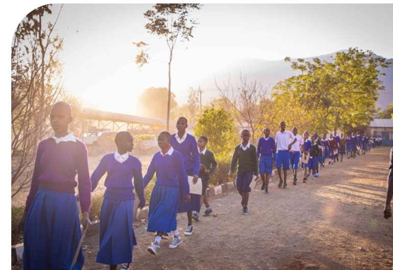
Below Bright and Early: Students enter the Babati centre just after 7am.

Around 500 students passed the exams and are in the running for the next stage – Poverty Assessments. Following these assessments, 150 students will be offered scholarships for O Level secondary education at St Jude's. "The day was a wonderful display of how team work and team spirit get the job done," Sarah enthuses.