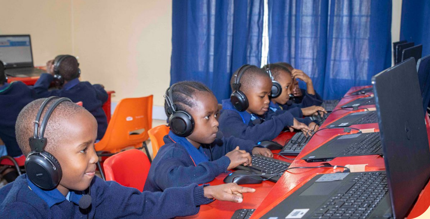
Above The Faces of Concentration: Even St Jude's youngest students are working hard in their ESL classes.

In order to implement the program, St Jude's ESL staff have worked with the IT team to create four dedicated ESL Labs – two at St Jude's Secondary School, one at St Jude's Girls' Secondary School and one at St Jude's Primary School. Here, students from Standard 1 to Form 6 attend twice weekly lessons under the guidance of the school's five specialist ESL teachers. Students can also visit the labs during free periods and on Sundays.