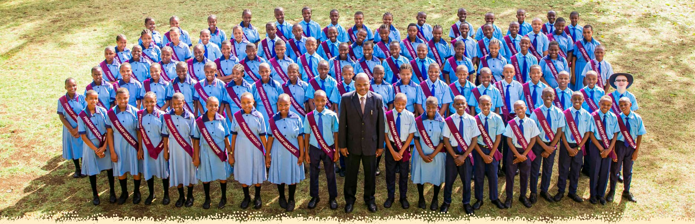
Above Graduation Day!: Standard 7 students celebrate their first academic milestone as they prepare to begin a new chapter in their education journey.