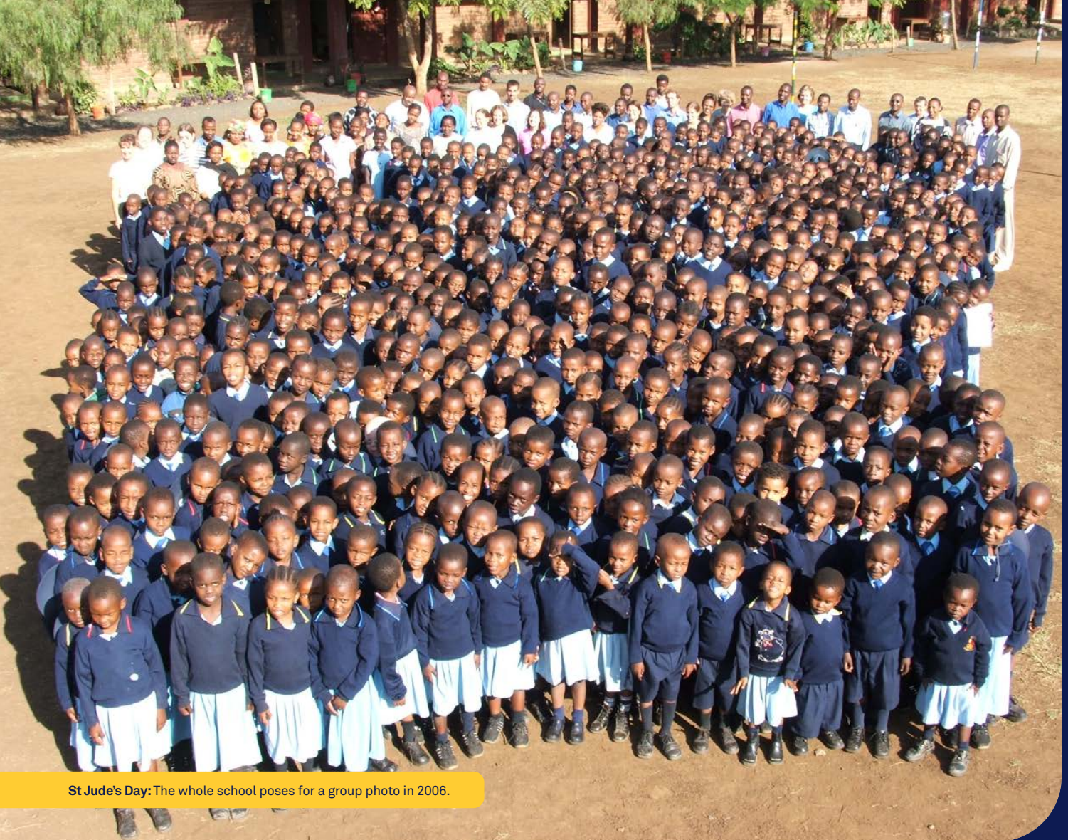
St Jude's Day: The whole school poses for a group photo in 2006.