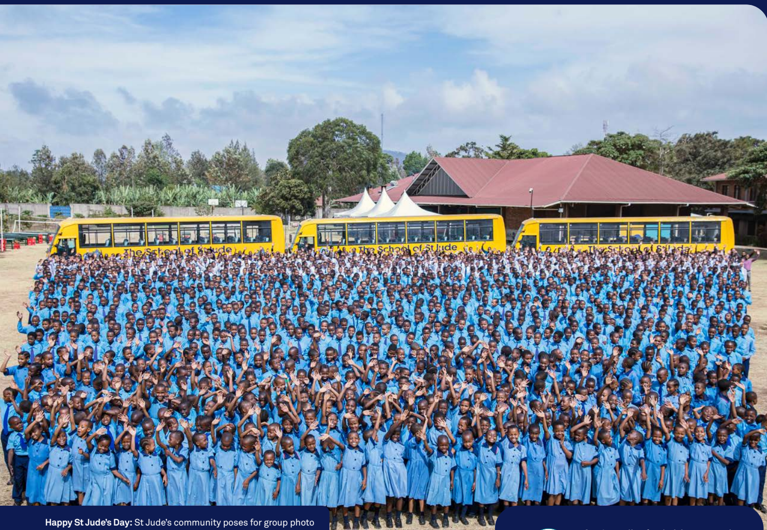
Happy St Jude's Day: St Jude's community poses for group photo