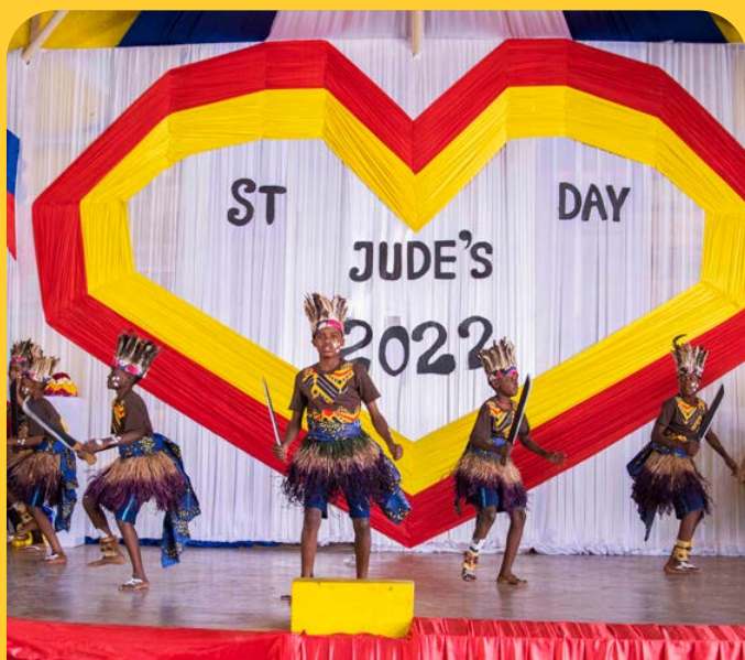
Celebrating St Jude's Day: Traditional dance from St Jude's primary students.