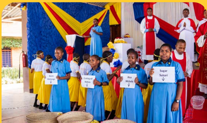
Keeping Up The Tradition: St Jude's students receiving donated gifts for the elderly.

The School of St Jude has come a long way over the last 20 years. As a community, St Jude's Day is an occasion of thanksgiving and togetherness and exemplifies the spirit of giving to those in need.