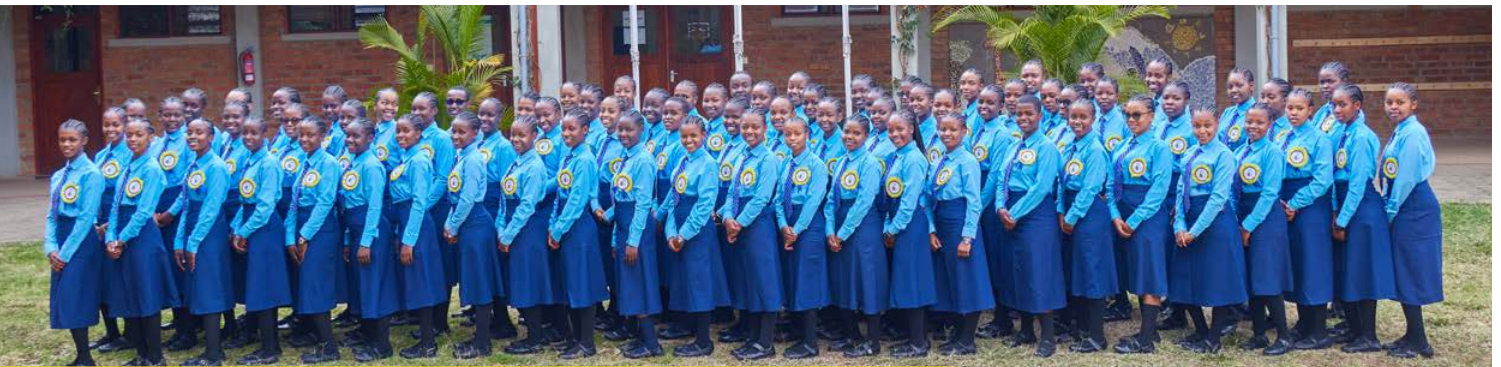
St Jude's 2022 Form 4 Graduates: (Top) St Jude's Secondary School Form 4 graduates and (bottom) Girls' School Form 4 graduates.