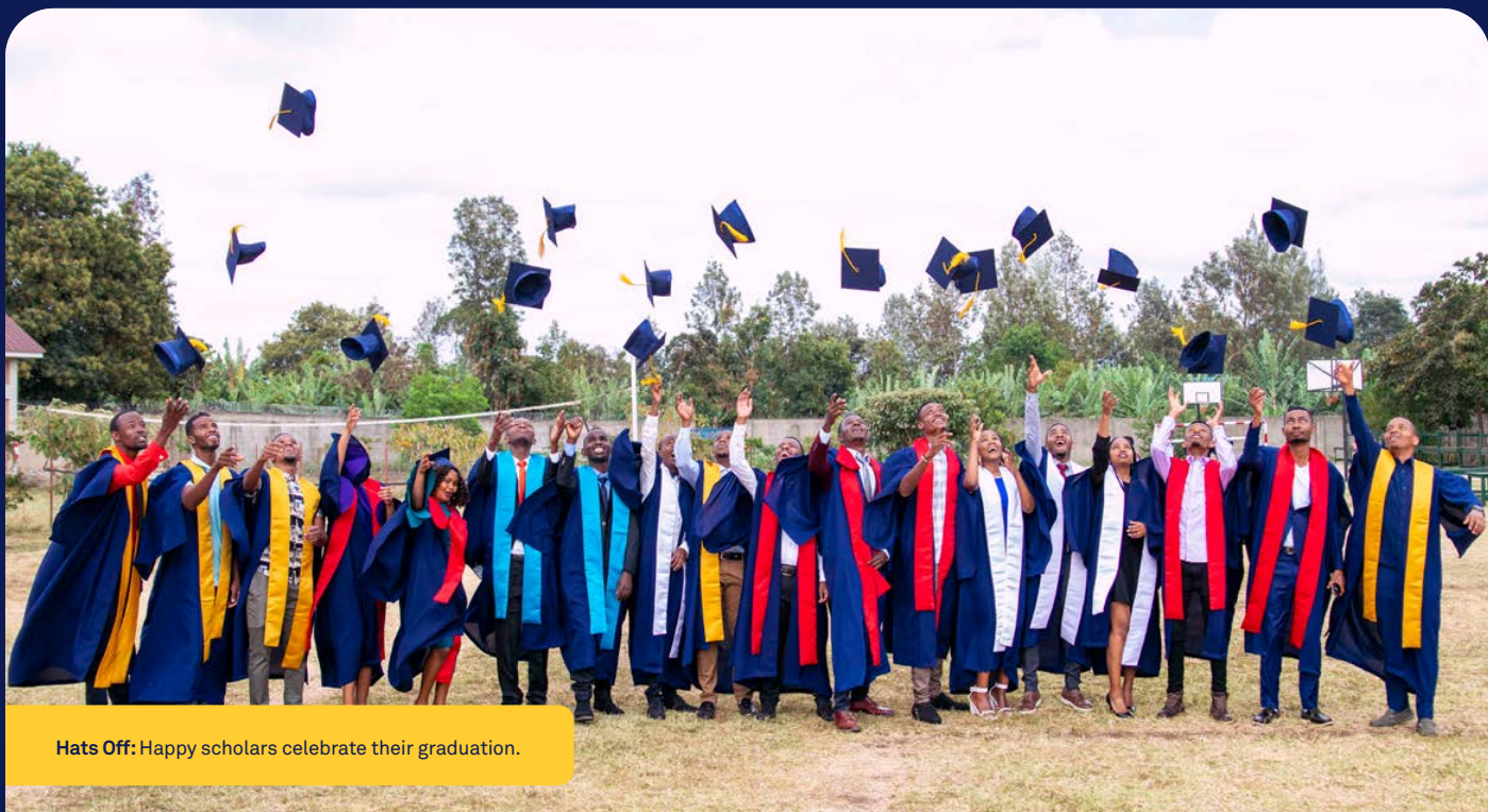
Hats Off: Happy scholars celebrate their graduation.

By supporting the BSJ Scholarship Program, you can help transform lives. Donate or sponsor today!