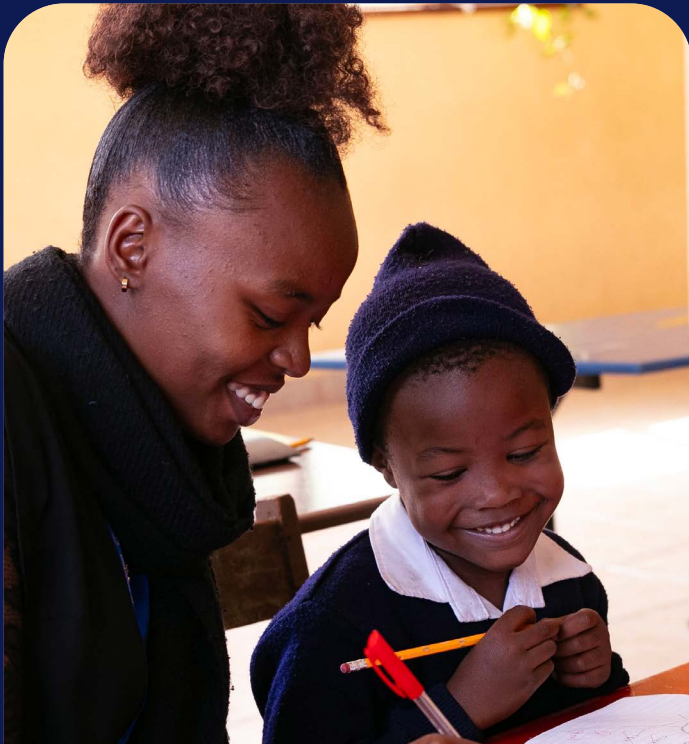
Listening closely: Potential student paying close attention during one of the classroom sessions at St Jude's.

Let's dive into our Scholarship Application Process for primary!