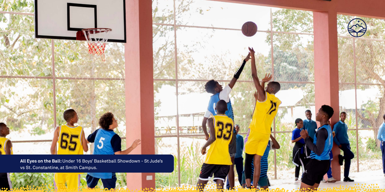
All Eyes on the Ball: Under 16 Boys' Basketball Showdown - St Jude's vs St. Constantine, at Smith Campus.