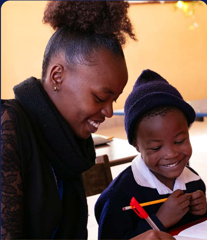
Listening closely: Potential student paying close attention during one of the classroom sessions at St Jude's.

Ever wondered how we offer scholarships? Let's dive into our Scholarship Application Process for primary!