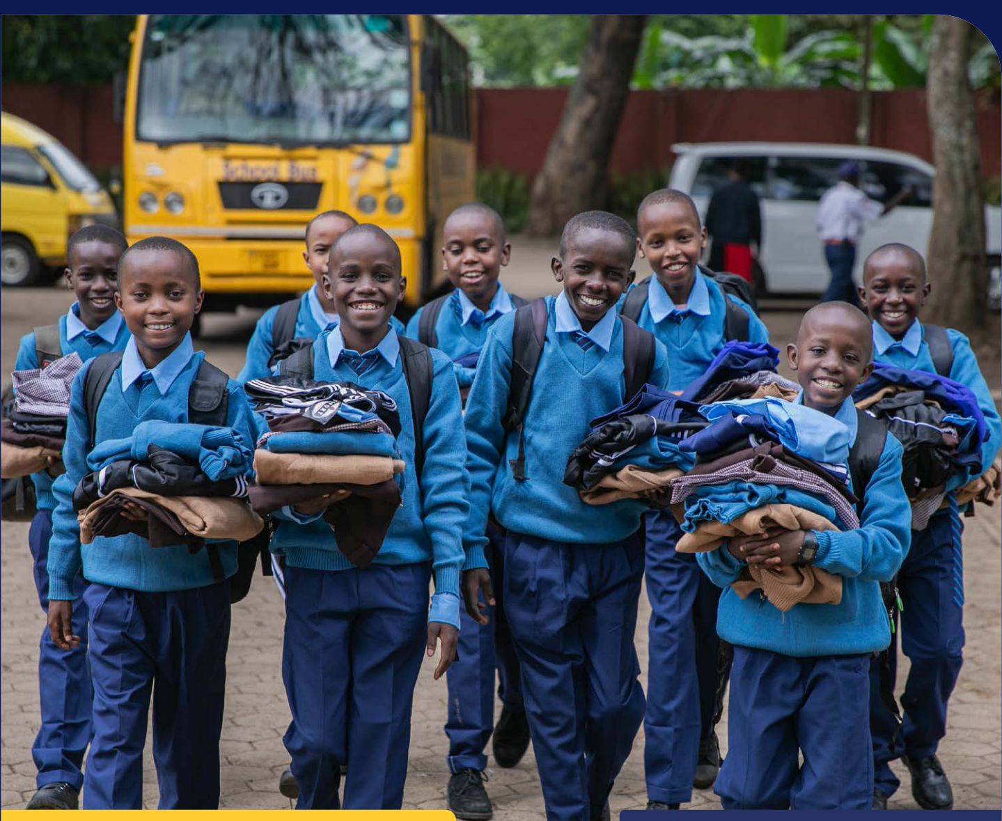
Coming in Hot: New Form 1 students sporting their new uniforms