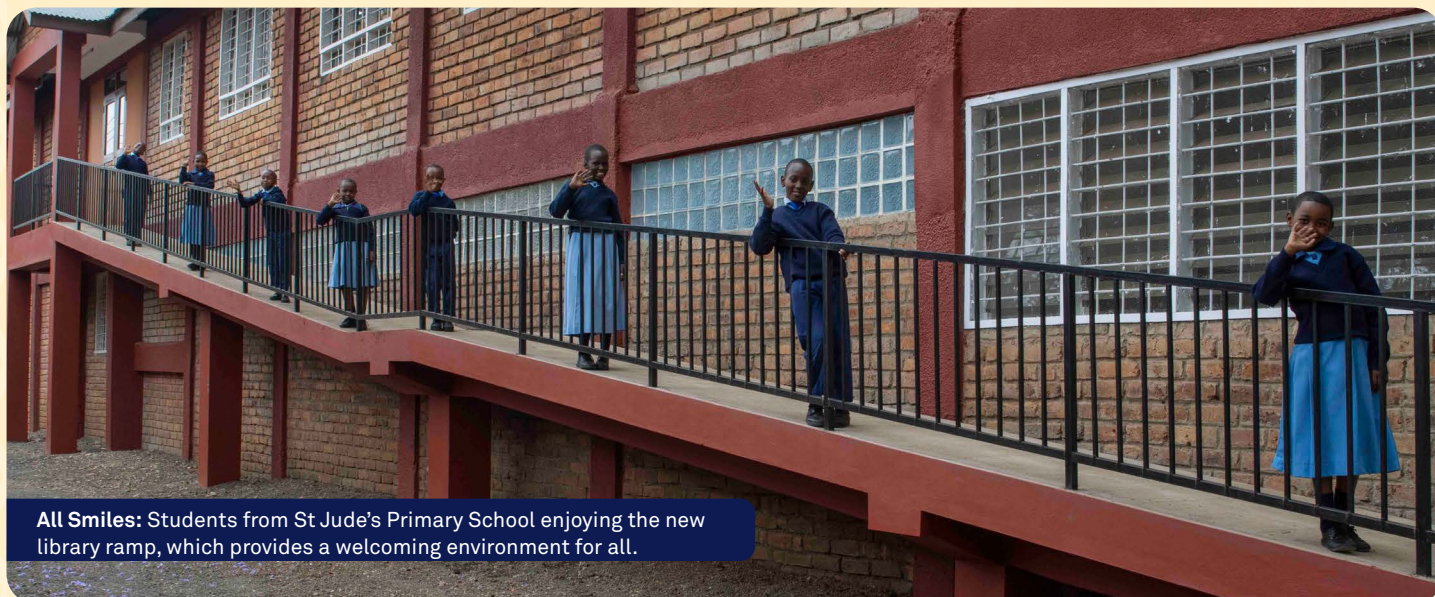
All Smiles: Students from St Jude's Primary School enjoying the new library ramp, which provides a welcoming environment for all.

A development at St Jude's Primary School library guarantees accessibility to more people.