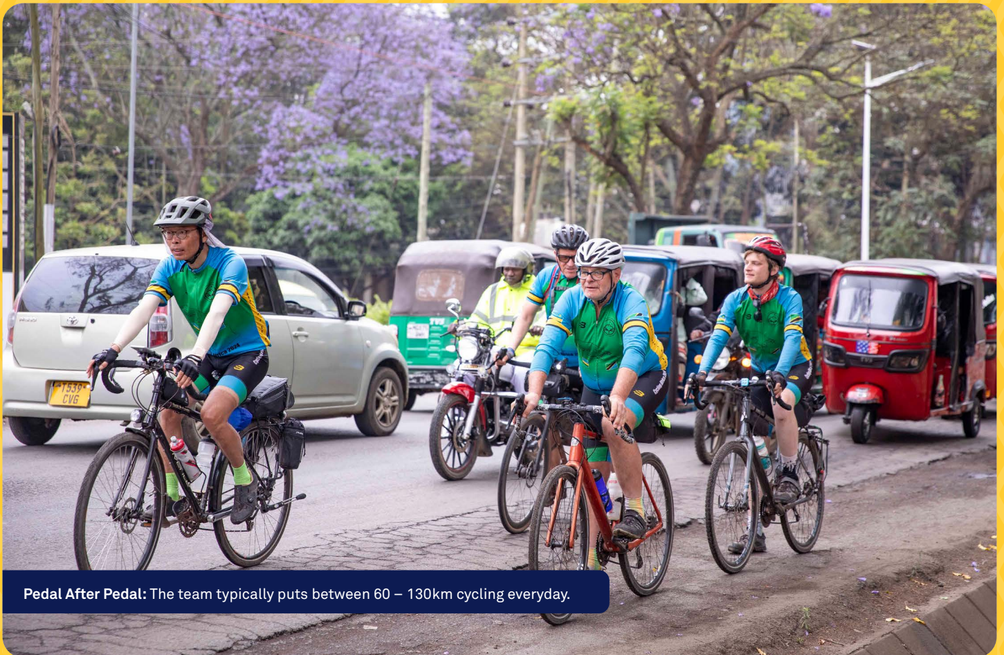
Pedal After Pedal: The team typically puts between 60 – 130km cycling everyday.

Although most of the team is mostly made up of men from older generations with established careers in law, banking, and medicine, this year's trip features a welcome change. One of the members from the previous expedition is bringing his son along for the adventure, making them the first father-son duo to cycle for St Jude's.