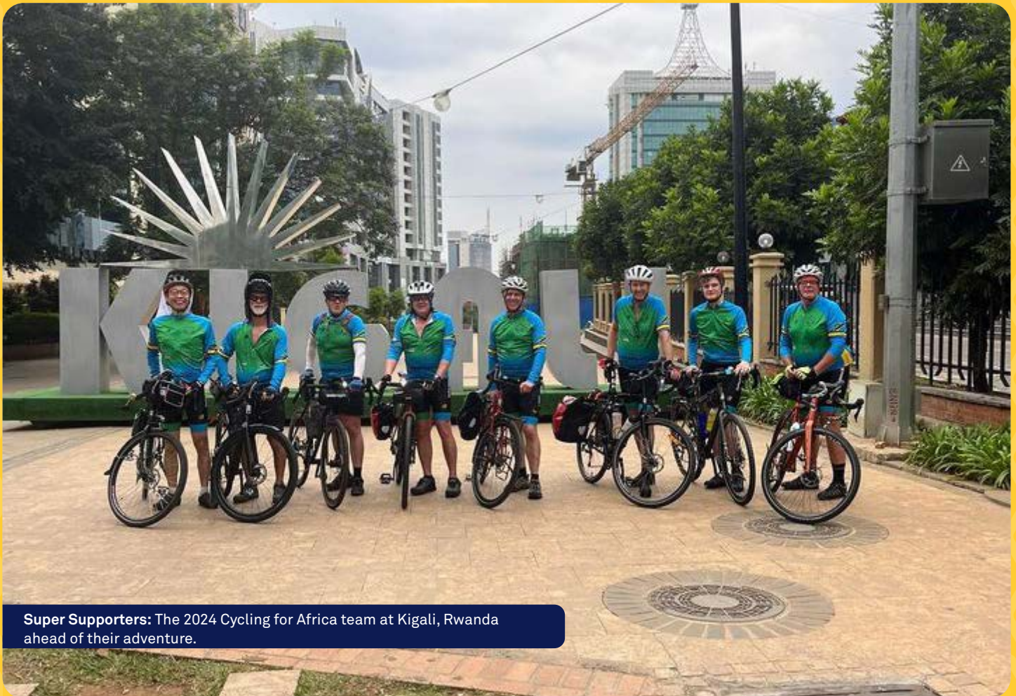
Super Supporters: The 2024 Cycling for Africa team at Kigali, Rwanda ahead of their adventure.

The 2024 Cycling for Africa team aims to raise AU$20,000 to support free education at St Jude's.