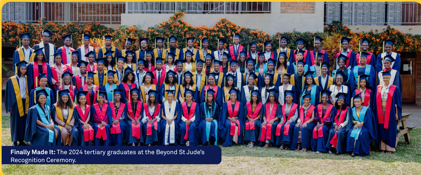
Finally Made It: The 2024 tertiary graduates at the Beyond St Jude's Recognition Ceremony.

Your continued support is shaping Tanzania's future leaders.