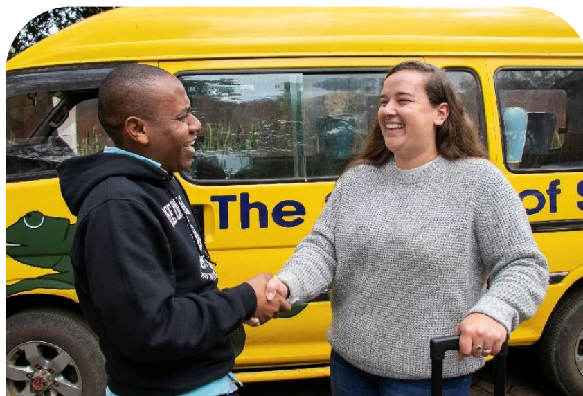
Figure 2: You will see the smiling faces of our team waiting to pick you up at the airport!

On your arrival at the airport, you will be welcomed by one of the Visitor team members, who will be holding a St Jude's sign displaying your name. They will be located at the exit at the arrival hall after you've collected your bags and passed through passport control.