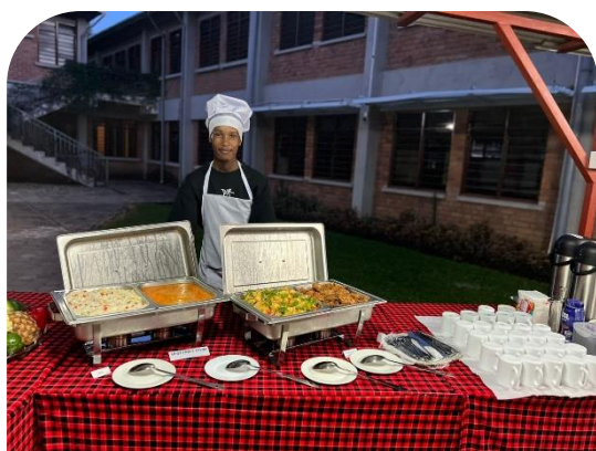
Figure 3: Our in-house catering can provide you with breakfast, lunch and dinner.

We are able to cater for all dietary requirements at St Jude's. If you do have any dietary requirements, please let us know prior to your arrival.