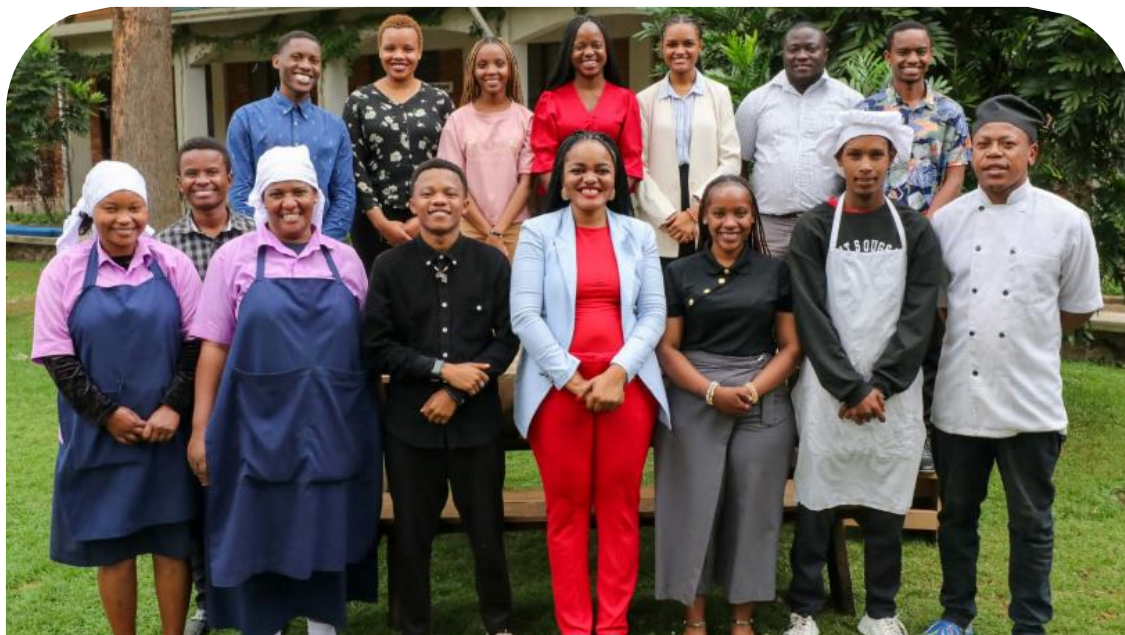
Figure 1: Our dedicated Visitors team is here to help you with whatever you need!

Here at St Jude's, we have a team solely dedicated to our visitors! Whatever you need, our Visitors Team will be able to assist you. With 20+ years of experience hosting visitors from around the world, our team is a friendly group of 12 staff, including professional chefs, housekeepers, reservation specialists, and operations personnel. Our team is always available on-site and can be contacted by phone at any time. You will receive personalised care and guidance throughout your entire visit, from the moment you arrive at St Jude's until you receive your thank you email after you leave.