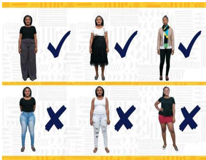
Figure 6: Simple dos and don'ts for attire around our students on campus.