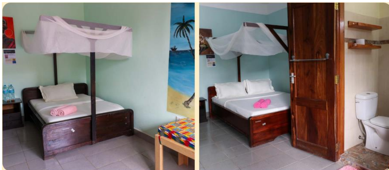
Figure 5: We offer motel-style rooms with hot water, an ensuite, wifi and laundry services