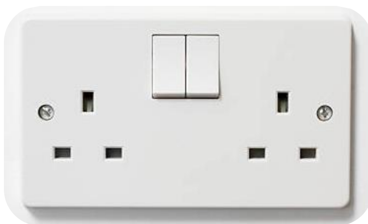
Figure : An example of what the Tanzanian socket looks like.