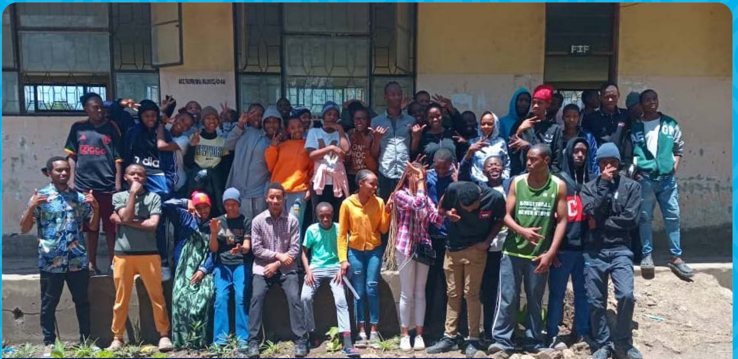
Paying it forward: Rogers initiative supports students in having open conversations about careers, confidence and practical study and exam techniques.

What makes their initiative especially impactful is how authentic and relatable it is. They understand the realities these students face because they have witnessed them closely in their own communities.